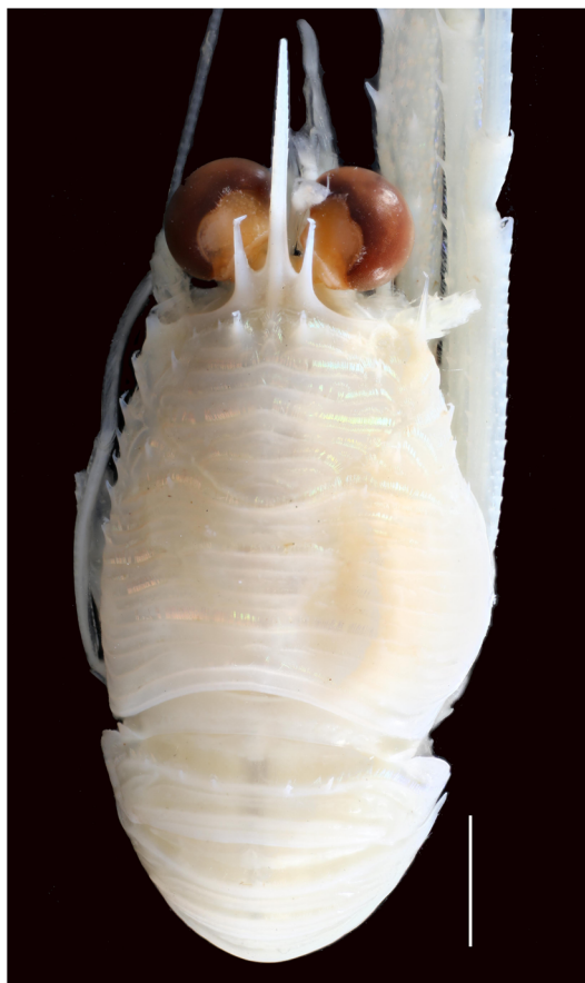
Fig. 1: Munida rutllanti Zariquiey Alvarez, 1952, dorsal view of male specimen (USNM 1492241) with swollen right branchial chamber caused by Anuropodione amphiandra (Codreanu, Codreanu & Pike, 1966) n. comb. Scale bar = 3 mm.

4b. Lateral plates of pleon overlapping ... A. amphiandra (Codreanu, Codreanu & Pike, 1966) n. comb. [Mediterranean Sea: Algeria to Turkey; Adriatic Sea, 60-400 m depth, infesting Munida rutllanti Zariquiey Alvarez, 1952].