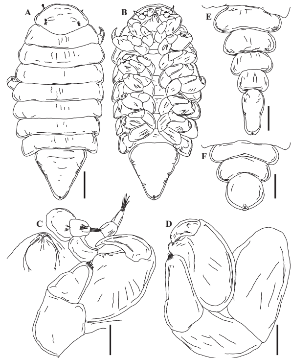
Fig. 4: Anuropodione amphandra (Codreanu, Codreanu & Pike, 1966) n. comb., male specimens USNM 1492250 (A-D), USNM 1492279 (E), USNM 1492241 (F). A, dorsal view. B, ventral view. C, mouthparts, left antennule (top), left antenna (bottom) and left pereopod 1. D, left pereopod 7. E, pleon with 5 segments. F, pleon with 3 segments. Scale bars = 250 \mu m (A, B, E, F), 50 \mu m (C, D).

All specimens with same collection data as USNM 1492241: 1 sinistral ovigerous female (6.48 mm), 1 mature male (1.85 mm), infesting left branchial chamber of female M. rutllanti (36 mm CL); 1 sinistral ovigerous female (6.89 mm), 1 mature male (1.24 mm), infesting left branchial chamber of female M. rutllanti (37 mm CL); 1