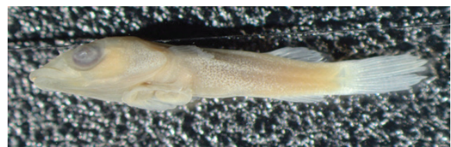
Fig. 2: Apletodon incognitus , PMR VP4421, juvenile of unidentified sex, 11.7+2.8 mm, Sikka l-Bajda off NE Malta, Malta.

Diagnosis. (1) three lachrymal canal pores; (2) three mandibular canal pores; (3) dorsal and anal fins normal, with strong rays; (4) dorsal fin rays 4-6, anal fin rays 4-6 (present material dorsal fin 4-5, anal fin 4-5); (5) no spine in subopercular region; (6) row of papillae present on central part of anterior half of sucking disc from region A to region C.