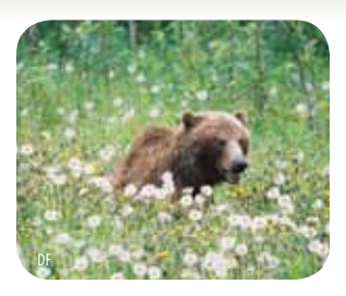
Grizzly Bear eating dandelions.

Avoid trampling. Follow trails and paths to avoid unnecessary trampling of vegetation. If you must move off the path, spread out to minimize the impact on one area.