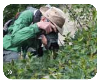
Awildlifeviewertakeshomeasouvenirofa uniqueplant, in the form of a great photo.