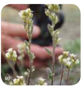
Yukon Draba is only found insouthwestYukonandnowhereelse on earth.

to evolve so that they are found no place else on earth. This has made Yukon one of the richest floral regions in Canada, with greater diversity than the Canadian prairies.