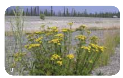
Common Tansy is mildly toxic and emits a pungent smell when crushed.

After habitat loss, invasive plants and animals are the greatest threat to biodiversity. Of the 120 plant species