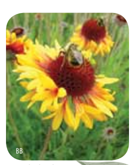
GreatBlanketFloweragardenplantthat has gone wild.