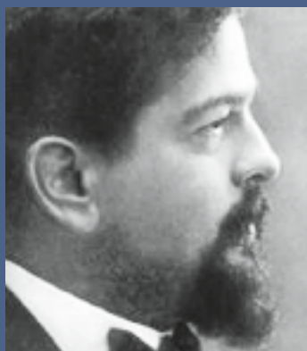
Composer Claude Debussy