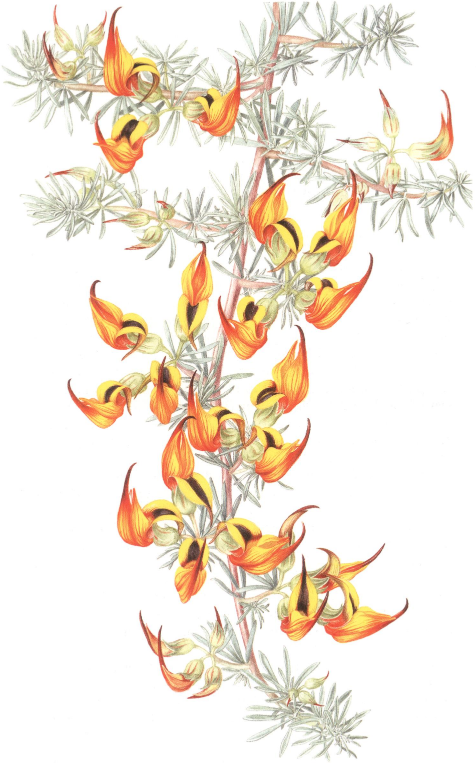
Plate 619 Lotus maculatus