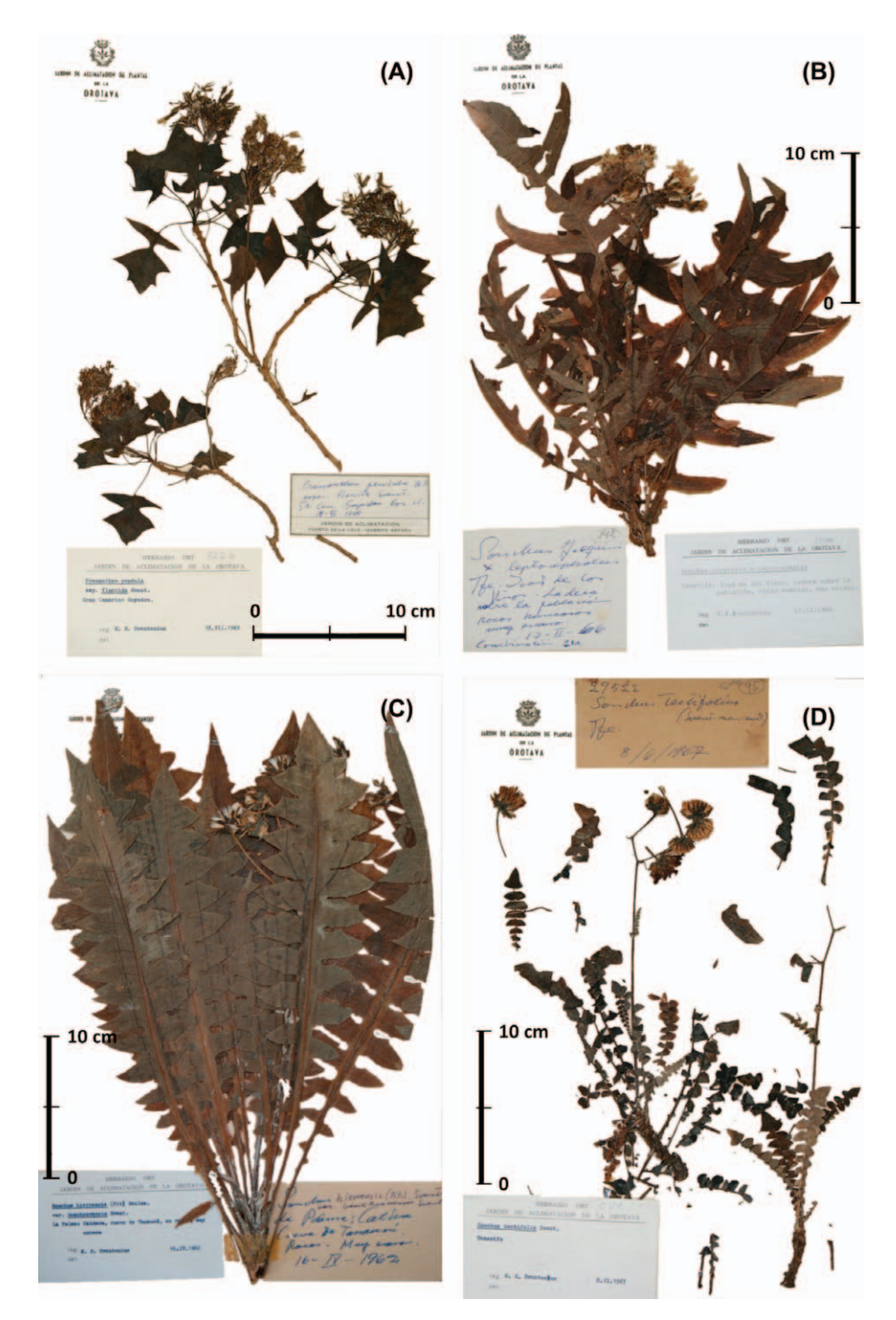
Figure 4. Types assigned to some names of taxa introduced in 'Plantae macaronesienses novae vel minus cognitae' (Sventenius 1969). (A) holotype of Sonchus pendulus subsp. flaccidus (Svent.) N. Kilian & Greuter (ORT 8226), (B) holotype of S. ×jaquiniocephalus Svent. (ORT 17056), (C) neotype of S. hierrensis var. benehoavensis Svent. (ORT 4403), (D) neotype of S. tectifolius (ORT 7119).

p. 6) – Taeckholmia filifolia (Svent.) G. Kunkel (1974, p. 28); nom. inval. (Art. 37.1) – Sonchus filifolius N. Kilian & Greuter, in Greauter (2003, p. 237), nom. illegit. (Art. 52.1).