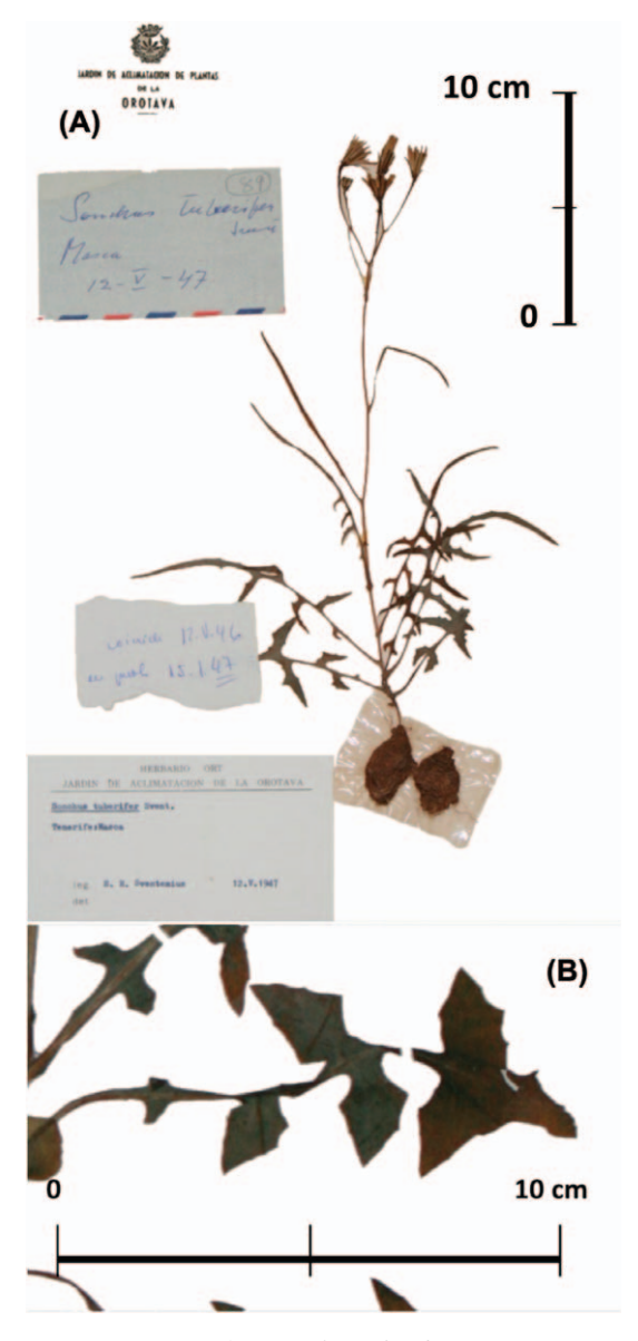
Figure 1. Types assigned to Sonchus tuberifer Svent. (A) epitype of typical variety (ORT 17199), (B) leaf detail from S. tuberifer var. latisecta Svent. lectotype (GB no. 194).