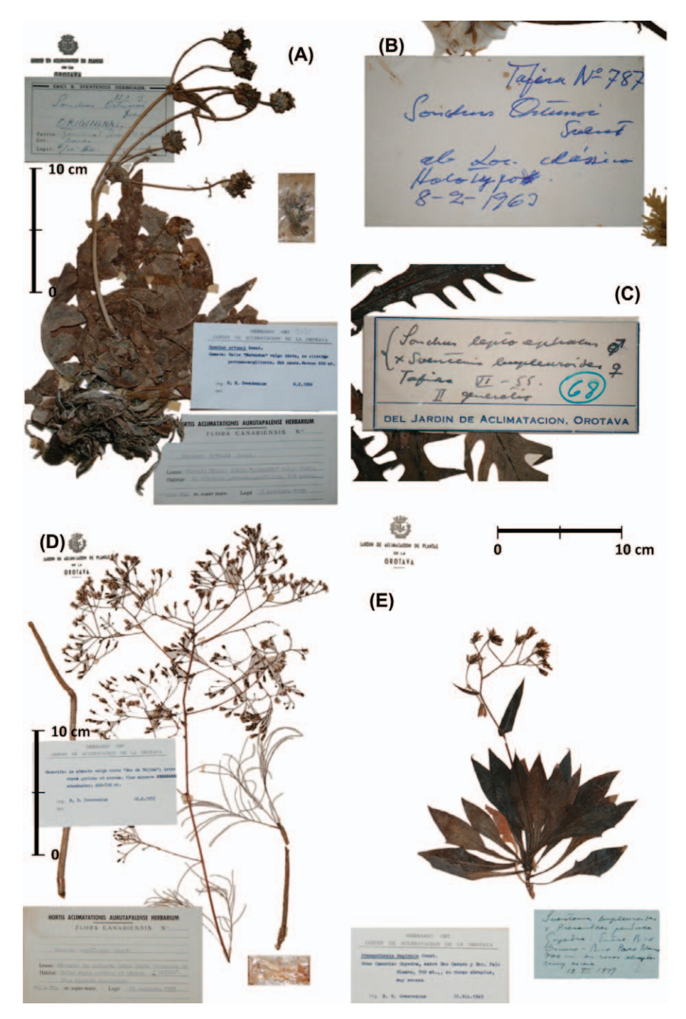
Figure 3. Typification of some names of taxa introduced in 'Additamentum ad Floram Canariensem' (Sventenius 1960). (A) holotype of Sonchus ortunoi Svent. (ORT 9031), (B) handwritten label for a specimen of S. ortunoi cultivated in Botanic Garden Viera y Clavijo (Tafira area, Gran Canaria) (ORT 23964), (C) handwritten label for a specimen of S. × decipiens cultivated in Botanic Garden Viera y Clavijo (ORT 9040), (D) isotype of S.capillaris Svent. (ORT 9024), (E) epitype of S. × rupicola (ORT 8231).