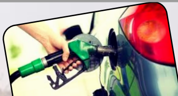
2017 CONSOLIDATED REPORT OF ACTUAL FUEL SALES BY PETROLEUM COMPANIES