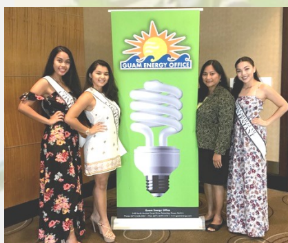
Candidates of the Guam Earth Organization attended GEO's Outreach Session held on April 17th at the Westin Hotel to learn about energy saving solutions leading to a clean island environment.