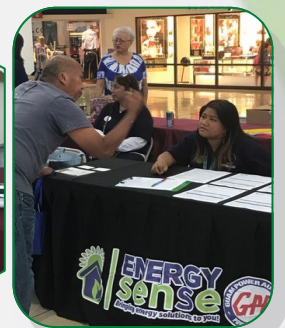
GEO sponsored the Guam Energy Expo at the Micronesia Mall in June to reach out to the community to invest in energy efficiency products to reduce their monthly power bills. The University of Guam's Center of Island Sustainability, Guam Power Authority, and energy-related businesses provided interactive booths featuring energy services and products.