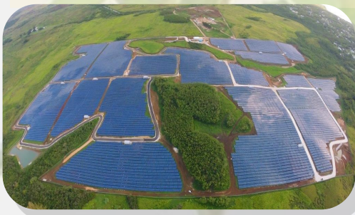
On April 28th, GEO sponsored a tour to Dandan Solar Farm for GovGuam officials. Guam Power Authority's largest renewable project is the solar farm in the south consisting of 121,792 panels spread out over 160 acres of land to produce 25.65 MegaWatts of clean, emission-free energy keeping Guam beautiful for generations to come.