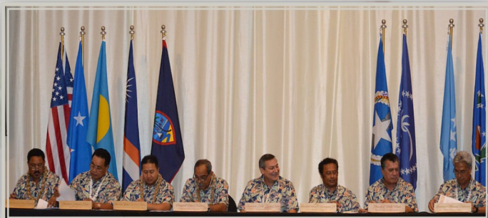
Leading the Regional Energy Committee, GEO presented to Governor Calvo (center), CNMI Governor and Presidents of FSM, RMI and Palau on renewable projects & energy issues at the 22nd Micronesian Islands Forum on May 2017 at Hyatt Regency Guam.