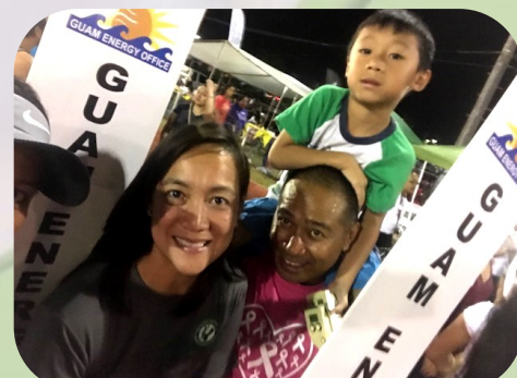
Representing GovGuam, GEO staff with family participate at the Relay-for-Life American Cancer Society event at the track & field of GW High School.