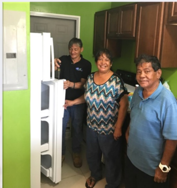
GEO replaced an old refrigerator with an energy efficient one in the house of senior couple living in Dededo after qualifying for free WAP services.