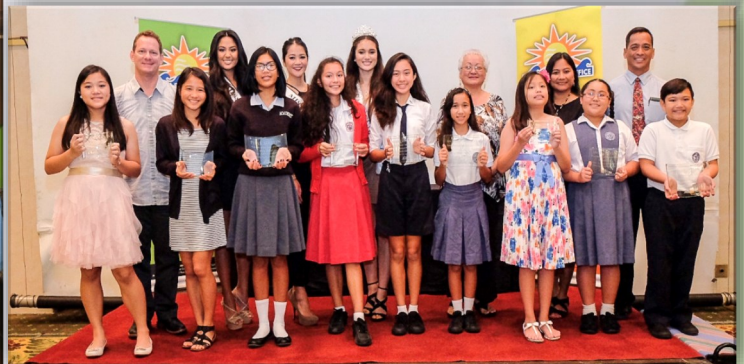
Along with Lt. Governor Ray Tenorio and Senator Frank Aguon, GEO recognized 9 students as winners of the 2017 Energy Poster & Essay Contest. Over 350 entries were submitted by students from participating elementary, middle & high schools island-wide.