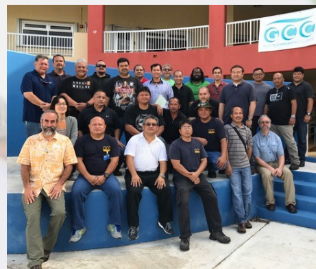
Held at Guam Community College utilizing a LEED building classroom on March 2017, GEO sponsored a Photovoltaics workshop utilizing instructors from Solar Energy International based out of Colorado to provide training to GovGuam building inspectors on PV applications, tools and design.