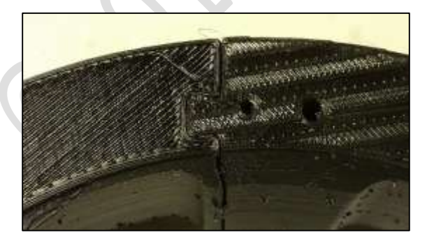
3) Slide the tabs together until fully seated.The top surfaces should be flush.Repeat for the other side.