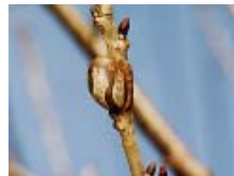
Fig. 3. Cocoon of C. flavescens