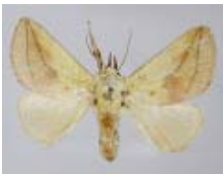
Fig. 1. Moth of C. flavescens

Plant Protection Service, The Netherlands