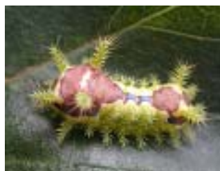
Fig. 2. Larva of C. flavescens