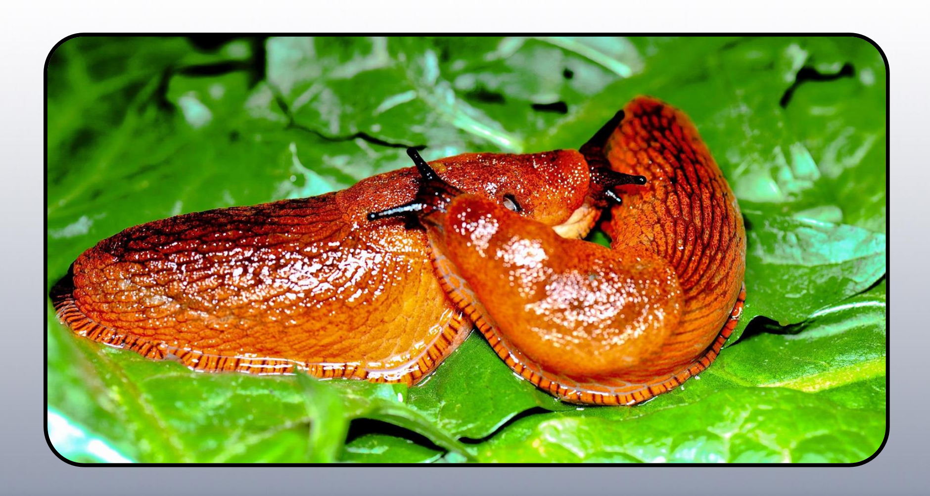
Image Credit: Bonsak Hammeraas, Bioforsk - Norwegian Institute for Agricultural and Environmental Research, Bugwood.org, #5393372