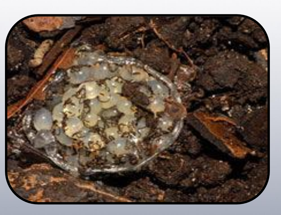
Chain of eggs around a clutch