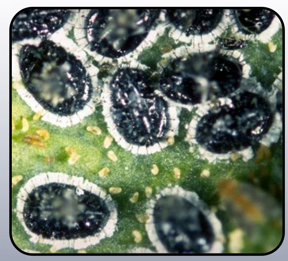
Image Credit: M.A. van den Berg, Institute for Tropical and Subtropical Crops, Bugwood.org # UGA1263006