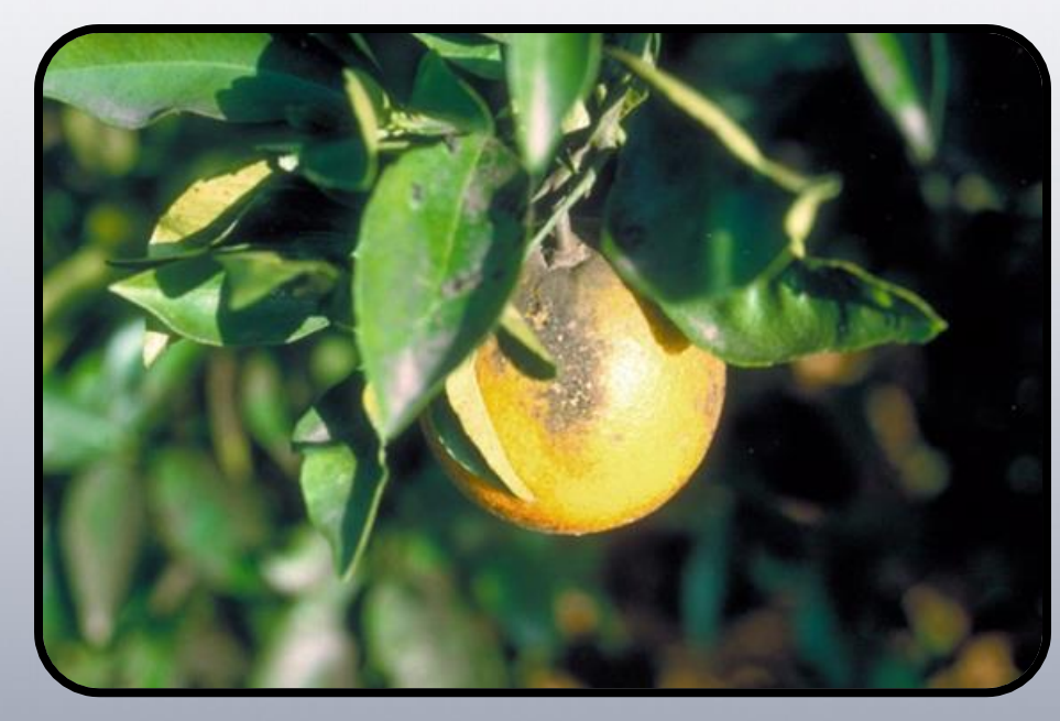
Sooty mold on citrus caused by this pest