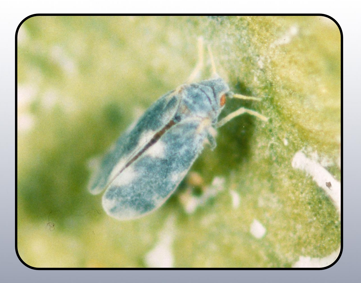
Image Credit: M.A. van den Berg, Institute for Tropical and Subtropical Crops, Bugwood.org #0177075