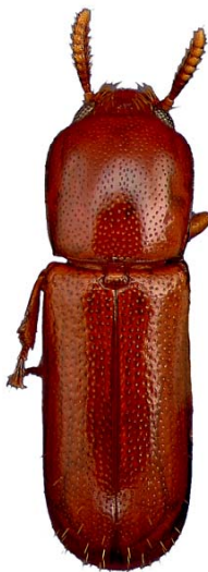
Fig. 5: Corticeus thoracicus (Melsheimer)

Comments: Only known from southern FL in U.S.; Triplehorn (1979) described this species from a specimen taken on Paradise Key, FL; similar species occur Cuba and Puerto Rico