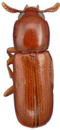
Fig. 2: Corticeus glaber (LeConte)