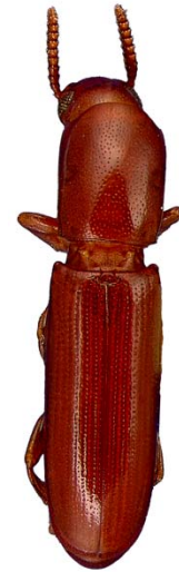
Fig. 4: Corticeus tensicollis Triplehorn

Comments: May be associated with bark beetles (Curculionidae)