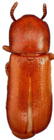
Fig. 3: Corticeus parallelus (Melsheimer)

Comments: Strong association with the bark beetle Dendroctonus frontalis (Triplehorn 1990)