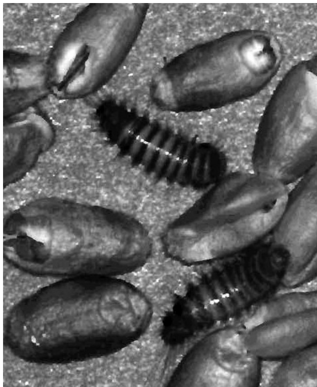
Figure 3. Khapra beetle, Trogoderma granarium larvae on wheat.

Permits are required to import commodities known to harbor T. granarium into the United States. This includes grains, seeds, nuts, dried milk, fish meal, meat and bonemeal, dried animal hides, and other products. Phytosanitary certificates are required for restricted commodities from countries that maintain inspection programs.