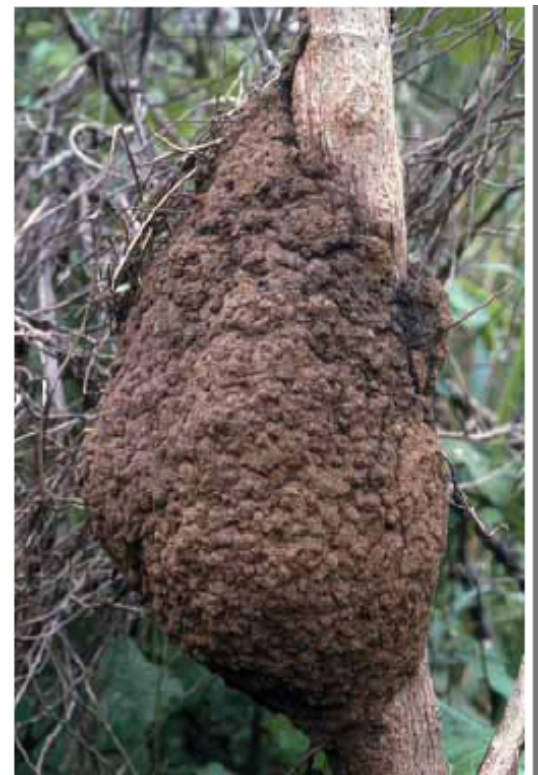
Classic Nasutitermes corniger nest, medium brown with slightly bumpy exterior. Shapes and host substrates vary, but nests tend to be spherical or ellipsoidal, often on or by a tree, shrub, stump, structure or other wood.

By removing and destroying entire nests, aggressively treating foraging trails and other activity zones and vigilantly inspecting and monitoring the known and surrounding infested areas, this progressive IPM effort reinvents termite control to take advantage of the vulnerabilities of this industrious and challenging invasive species. As in any IPM initiative, the strategy is to capitalize