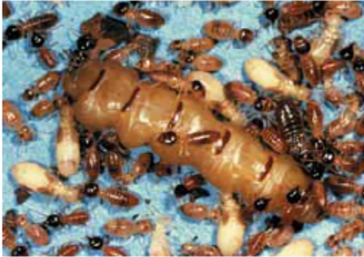
Queen, with enlarged abdomen capable of rapid egg production, along with King (right, above end of Queen's abdomen) and entourage of soldiers, workers, and nymphs (future alates).

The state will use local waste incinerators so nests can be destroyed immediately after collection and without risk of inadvertently moving a colony out of the restricted area.