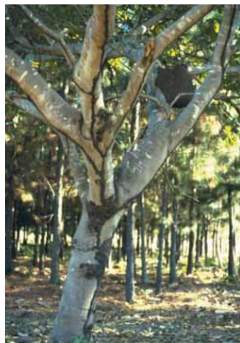
Extensive foraging tunnel network characteristic of this species, including nest on branch in upper right.

The overall strategy of DACS’ 2013 treatment protocol is to remove and destroy accessible nests and use termiticides to comprehensively treat trees, stumps, structures and substrates