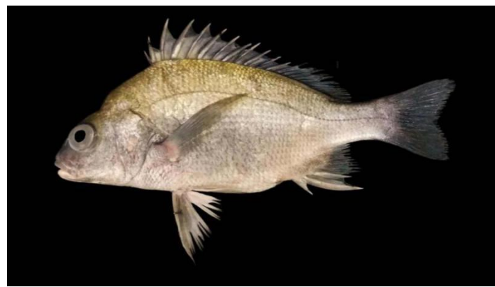
Figure 2 Pomadasys aheneus from the Iraqi marine waters