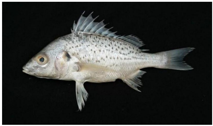
Figure 3 Pomadasys commersonnii from the Iraqi marine waters

Total length 240 mm. Body relatively elongate its body depth 33.50% in standard length, Body width 12.76%. Head length 36.86%. Snout pointed its length 12.96%. Eye diameter 8.14%. Mouth small. Two pores and a median pit on chin. Dorsal fin with 11 spines and 13 soft rays, Pectoral fin has 17 rays, anal fin with three spines and eight soft rays. Gill rakers 7 on upper limb and 14 on lower limb of first gill arch. The color was silvery with small black spots on upper of body and on nape (Figure 3).