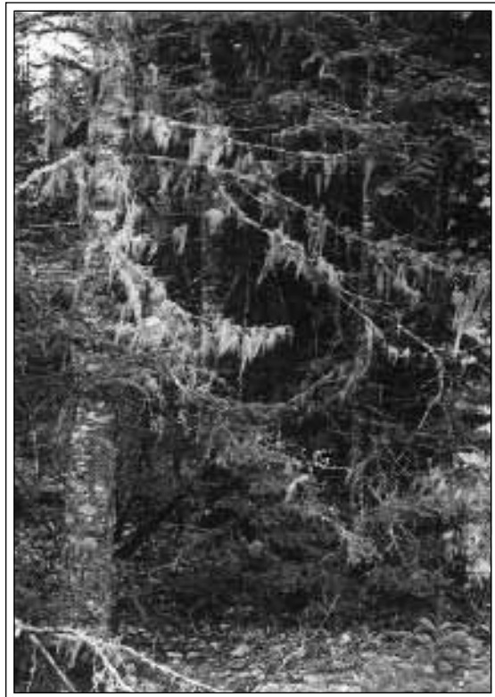
Plate T10.11.1: The Usnea spp. are commonly known as Old Man's Beard, shown here in a typical spruce forest near Stewiacke in sub-Unit 511a.

Corticolous lichens form distinct successions of species on tree bark and dead wood, paralleling the successional developments of the forest itself. 1,2 Hardwood and softwood trees in dry, mesic and wet sites support moderate to abundant lichen growth. 4 On mountain slopes of the Atlantic Interior (Region 400) and Avalon Uplands (Region 300), corticolous macrolichens grow among numerous microlichens on the trunks of shade-tolerant hardwood trees. 3 Typical of the moist pioneer forest are Alectoria , Bryoria , Fistulariella , Graphis , Platismatia and Tuckermanopsis . 5,6,7 In the climax forest, Flavopunctelia , Heterodermia , Lobaria ,