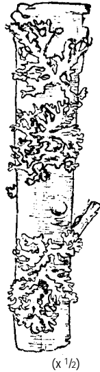
Figure T10.11.2: Hypogymnia physodes , commonly known as Puffed Lichen, is a corticolous species most frequently found growing on trees and shrubs; however, it has been known to colonize sand on Sable Island.

Fir and spruce are often draped with dark strands of Alectoria sarmentosa , greyish-green Bryoria