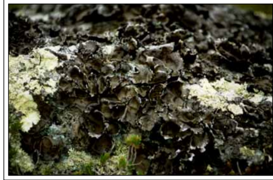
Plate T10.11.2: A saxicolous lichen, Actinogyra muehlenbergii , on a granite boulder.

Reindeer Mosses are commonly mistaken for moss, but are in fact soil-inhabiting lichens. These species are common winter food for deer, who also browse on tree lichens. Browse lines in forest stands are a common sight in Nova Scotia after a harsh winter.