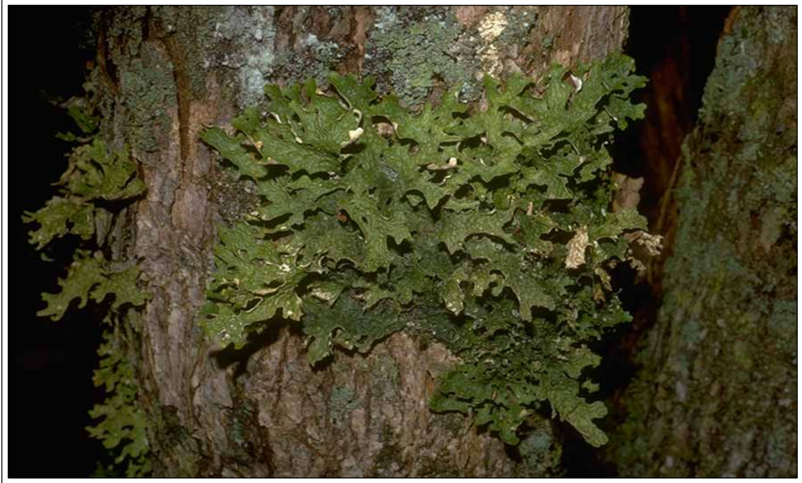
Plate T10.11.3: Lobaria pulmonaria a foliose, corticolous macrolichen characteristic of old-growth deciduous forest.