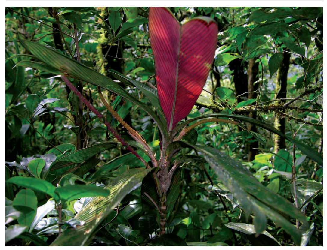
4. Only the youngest leaf shows the red underside. Notice three inflorescences, one with fruits.

the leaves can be proportionately wider, up to 2.5 times as long as wide; variation in leaf proportions has also been noticed by other observers (see Gray 2006). When fully expanded, young leaves appear wider than mature ones. During preparation of herbarium specimens the leaves seem to become somewhat narrower, probably because the plications become more pronounced after drying.