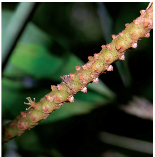
5. Few male flowers are produced per day on each spike.

the impoundment of debris is an adaptation to increase the quantity of nutrients available to the plant. When it rains, nutrients from the decomposing debris leach to the base of the stem and toward the roots.