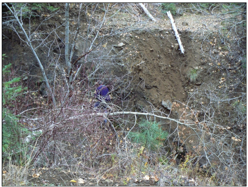
Figure 6. Washed out road crossing that BLM would not use under the Proposed Action and Alternative 3 that could be closed to motorized use.

However, roads to be decommissioned will require some physical work in addition to the database change.