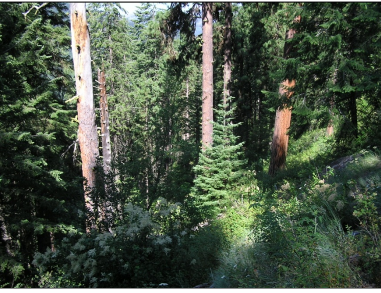
Figure 2. Forested stand proposed for treatment

Actions VF-1.1.1 and VF-1.1.3 (page 22 and Appendix C). Of the 631 acres proposed for timber harvest, 53 acres would be in old growth stands as classified using criterion of Hamilton (1993). As noted in the RMP the old growth is not a separate class but are a part of the large tree component. This alternative would reduce the existing 195.5 acres of old growth stands in the project area by 5.3 acres. In addition to burning of slash in the harvest units, this alternative proposes to apply prescribed fire to the landscape to reduce surface and ladder fuels on approximately 798 acres.