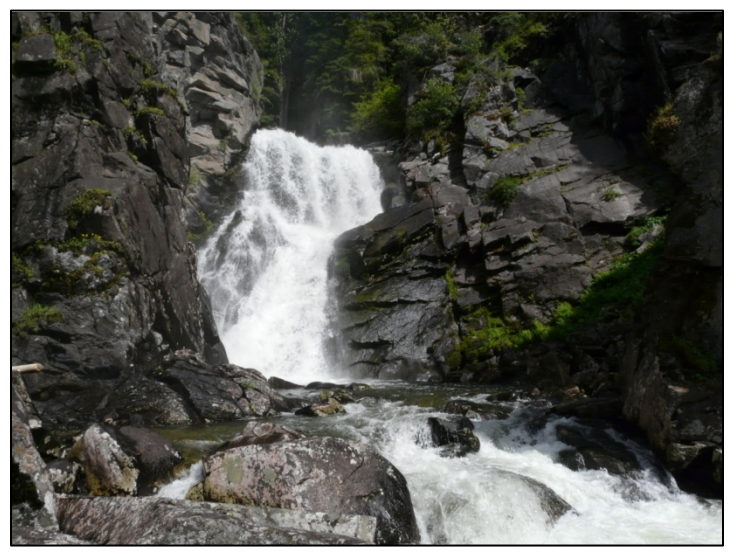
Figure 8. Hazard Creek falls fish passage barrier

Within the Little Salmon River subbasin, the Hazard Creek watershed is rated as a priority/special emphasis watershed for spring/summer Chinook salmon, steelhead trout, and bull trout. The drainage provides spawning and rearing habitat for spring/summer Chinook salmon and steelhead trout. Bull trout use the stream for subadult/adult rearing. A full passage barrier (falls) is located at stream mile 3.7 which restricts listed species habitat to the lower reaches of the stream (Map 13). Adfluvial bull trout have been transplanted in three mountain lakes in the upper drainage. The success of these transplants is