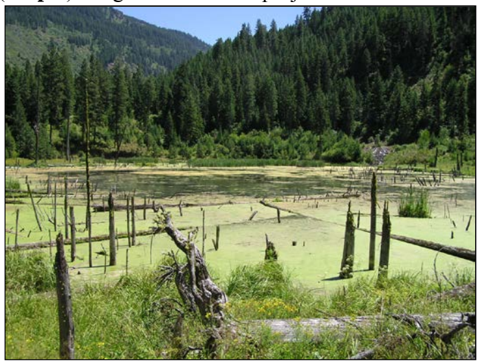
Figure 3. Large pond proposed for restoration

This alternative includes restoration treatments on a 4-acre forest type wetland including weed control, seeding, decommissioning of roads adjacent to pond/wetland, and planting riparian vegetation.