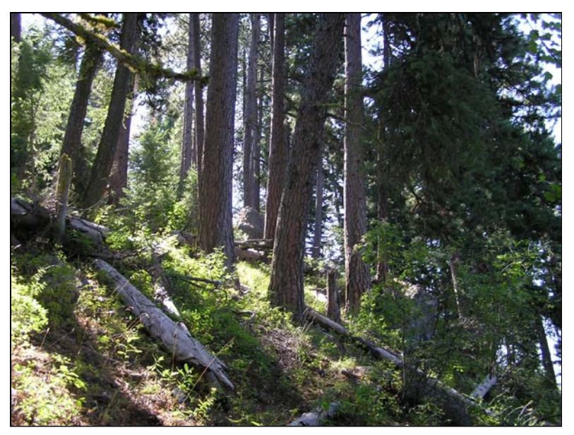
Figure 1. Bally Mountain old growth stand

to an overstocked condition with increased ladder fuels. The