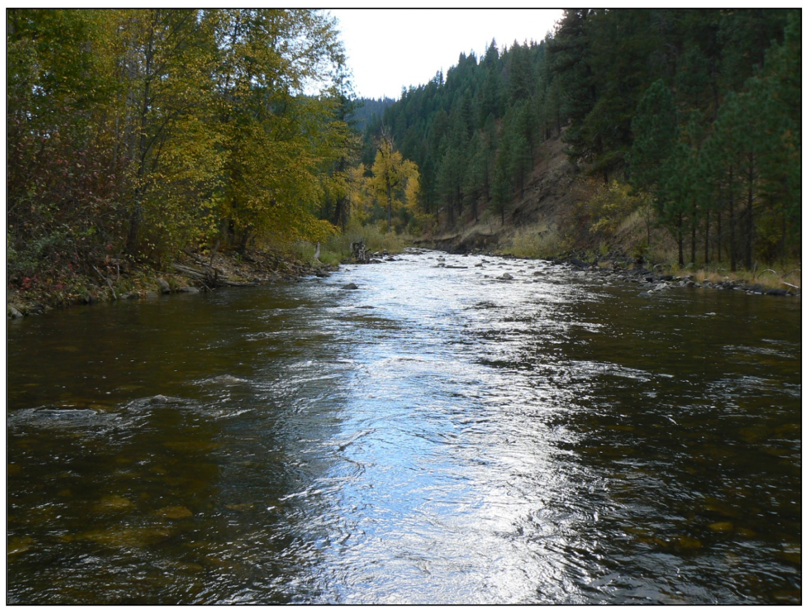
Figure 7. Little Salmon River, about 0.5 mile upriver from mouth of Hazard Creek.