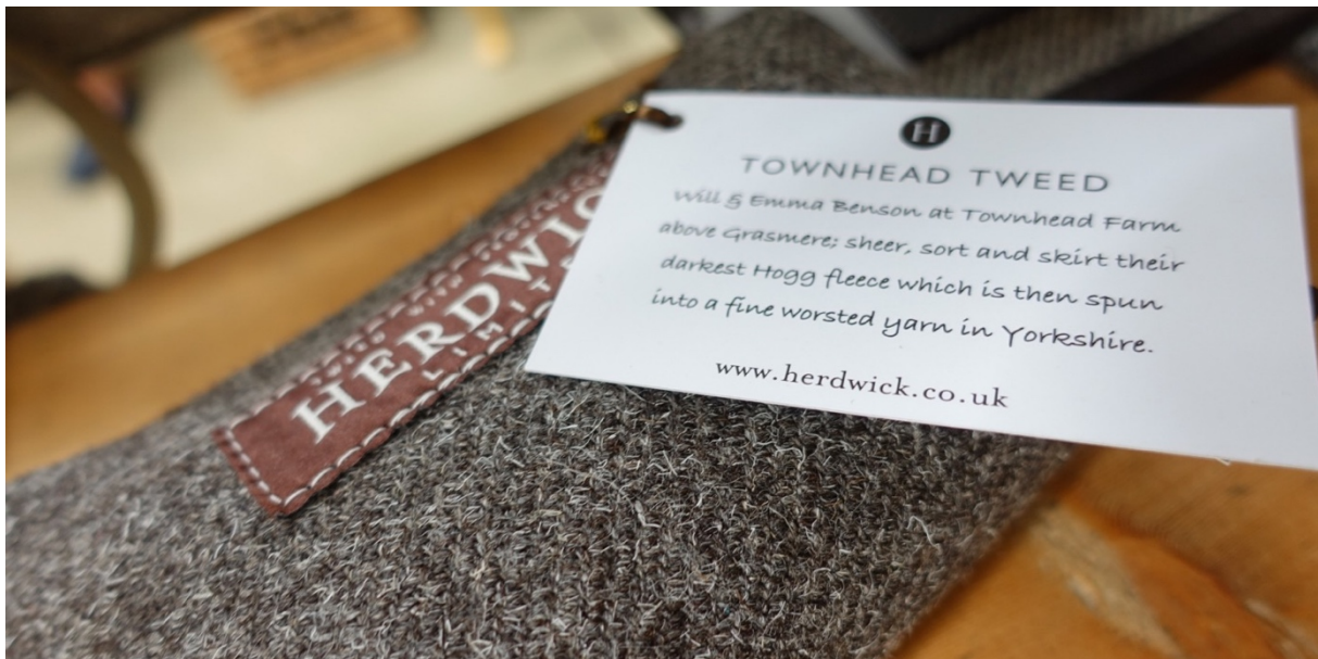
Figure 4: Townhead Tweed by Herdwick Limited

Located in Near Sawrey, a small village in south Cumbria, Herdwick Limited produces bags and accessories made from tweed. Based in Castle Cottage, the former home of Beatrix Potter, the sole proprietor Mandy lives as the custodian for the National Trust. Mandy purchased some Herdwick tweed fabric to re-upholster a window seat in the cottage, but ran out and set out on a journey to make her own fabric which she would use for bags and accessories.