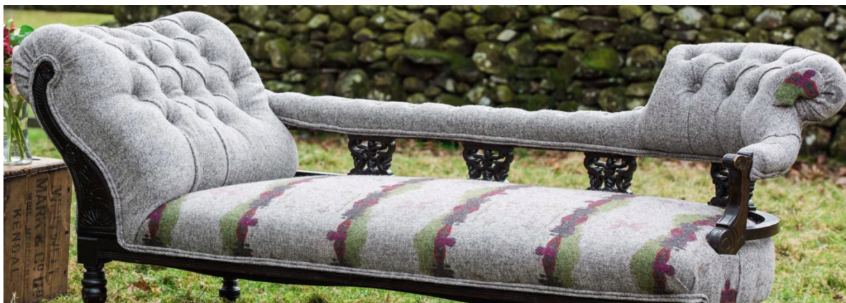
Figure 2: Re-upholstered chaise longue by Cable and Blake

This company, run by two friends, is located in Kendal, a small market town in the southern part of the county of Cumbria. The town has a rich history associated with the wool trade and has the motto “ Wool is my bread ”. The owners of Cable and Blake work part-time in the enterprise from their small shop on the town’s main street. Their fabric is designed in-house using the local landscape as inspiration for colour palettes and abstract patterns.