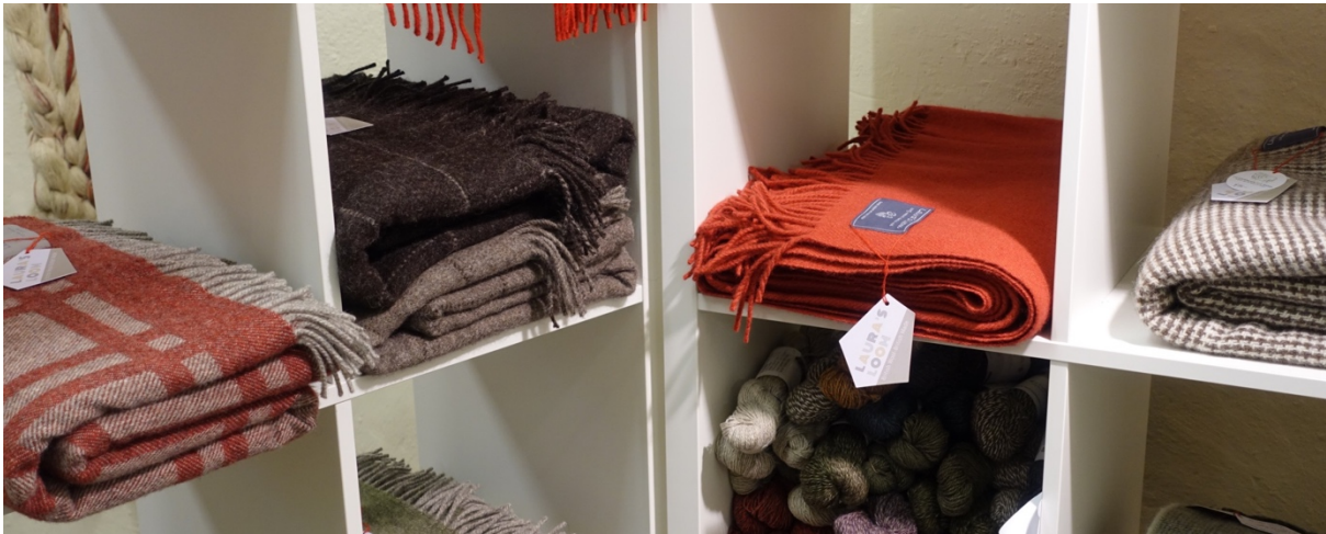
Figure 3: Woven products by Laura's Loom

moving to the small market town of Sedbergh, to the east of the county. She produces a range of hand woven and commercially woven products, including scarves, throws, socks and blankets. Her products are made from a mix of Blue Faced Leicester and Swaledale fleeces.