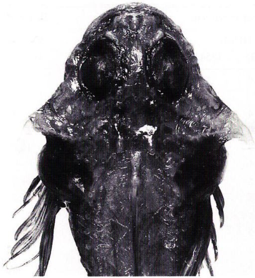
Fig. 2. Dorsal view of head region of Phasmatocottus ctenopterygius , HUMZ 175436, 56.3 mm SL.

united, forming a fold across the isthmus; six branchiostegal rays; teeth present on prevomer, absent on palatines; dorsal fin spines not connected by membrane; pelvic fin rays I, 2; lateral line pores double (Bolin, 1936). The present specimens agreed well with the type specimen and the original description of Phasmatocottus ctenopterygius . In the original description, Bolin (1936: 34) noted, "The small structure at the anterior end of the anal fin in this fish certainly appears to be a spine, although it may possibly be the basal portion of a broken ray that has attained a sharp point and smooth appearance. — It may be possible that this species has retained one anal spine as a primitive feature, and only examination of a second specimen can clear up this point." Although such a structure was reconfirmed by our observation of the holotype and its