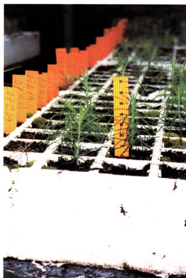
Photo. 7. Seedlings developed from seeds from Boguchany (region No. 9)