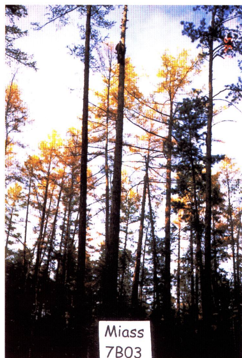
Photo. 2. Seed trees from central Siberia.

top left; Novokuznetsk (region No. 10), top right; Boguchany (region No. 9), bottom left; Altai (region No. 11), bottom right; Miass, Ufa (region No. 7)