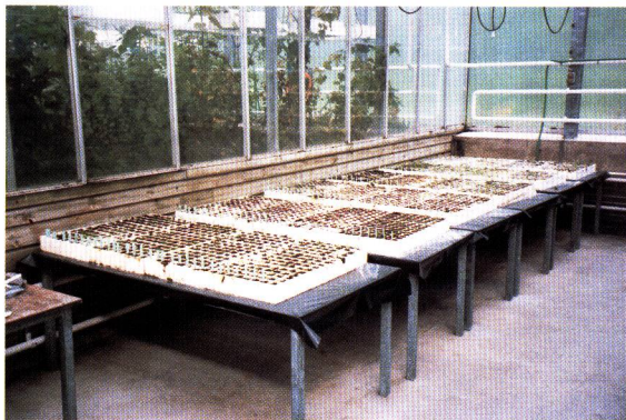
Photo. 4. Germination test in green house.