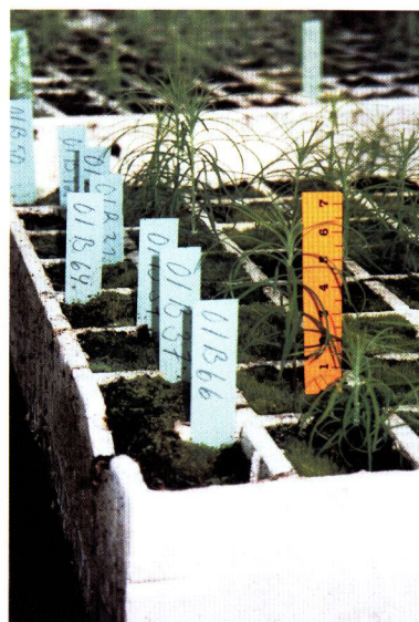
Photo. 5. Seedlings developed from seeds from Vizhnij Novgorod (region No. 1)