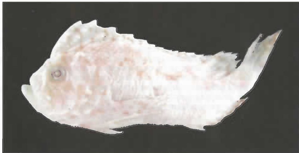
Fig 1. Cocotropus roseomaculatus sp. nov., SAIAB (RUSI) 39731, holotype, 29.2 mm SL.

Description. Dorsal fin rays XII, 8 (last ray double); anal fin rays II, 6 (last ray double); pectoral fin rays 13 on both sides; pelvic fin rays I, 3; segmented caudal fin rays 6 (upper) +6 (lower); bony sensory tubes on lateral line 9 (left side) and 11 (right side); gill rakers 1+9=10; vertebrae 26 in total. Proportions as % SL: HL 34.6; snout length 9.9; orbital diameter 8.9; lachrymal length 16.1; upper jaw length 17.5; lower jaw length 20.5; interorbital width 9.6; predorsal length 12.7; preanal length 68.8; length of dorsal fin base 80.1; length of anal fin base 21.6; length of caudal peduncle 19.5; depth of caudal peduncle 9.6; pectoral fin length 32.8; pelvic fin length 15.1; length of first dorsal spine 21.6; length of second dorsal spine 21.9; length of