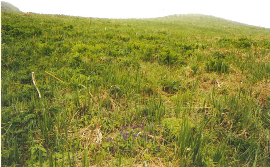
Figure 2. Meadow with Corydalis ambigua , Iris setosa and Veratrum grandiflorum on Demina Island.