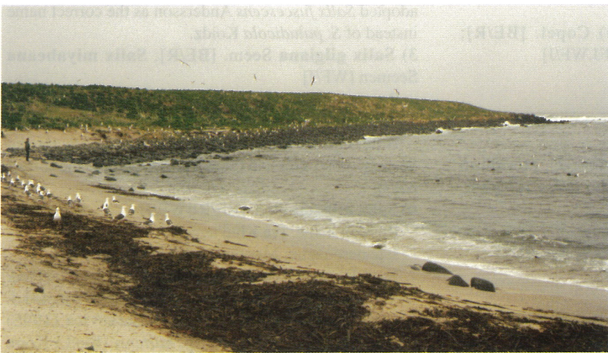
Figure 3. Seacoast on Storozhevoy Island.