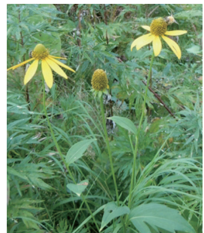
A large colony of Rudbeckia laciniata , found along road to the mouth of the river Setatovskaya (Seoi-gawa).