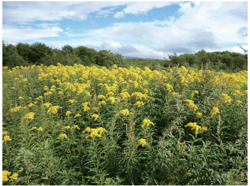
Solidago gigantea subsp. serotina in Kuril'sk (Shana).