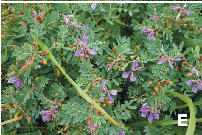
Figure 2. A. Tornaya Bay. B. Camp site on meadows above bay. C. Lakeside of Sopochnoye. D. Meadows on coastal terrace between Tornaya Bay and Senokosnaya Bay. E. Astragalus japonicus . F. Aralia cordata .