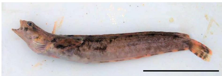
Fig. 1. Fresh coloration of present specimen (HUMZ 230899, 112 mm SL). Scale bar indicates 50 mm.

Genus Stichaeus Reinhardt, 1836 comprises 5 valid species : Stichaeus fuscus Miki and Maruyama, 1986, S. grigorjewi Herzenstein, 1890, S. nozawai Jordan and Snyder, 1902, S. ochriamkini Taranetz, 1935 and S. punctatus (Fabricius, 1780) (Miki and Maruyama, 1986 ; Mecklenburg and Sheiko, 2004 ; Pitruk et al., 2011 ; Fricke et al., 2020). Stichaeus nozawai is easily distinguishable from its congeners in having the 2nd pelvic-fin soft ray longer than the 3rd ray, 15-16 pectoral-fin rays and 37-39 caudal vertebrae (vs.