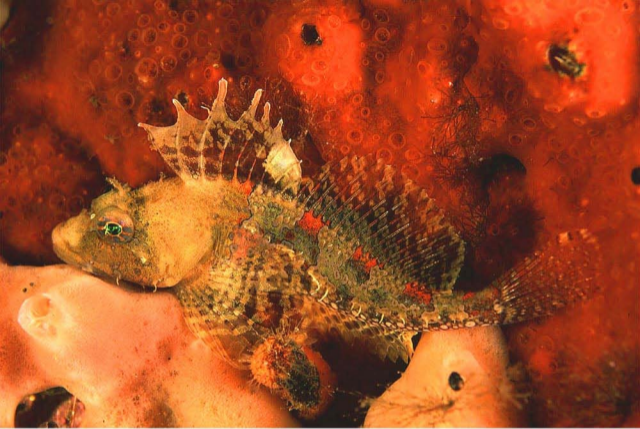
Fig. 2, Tsuruoka et al., A new cottid species from Japan, scale ratio 100%, two-column width