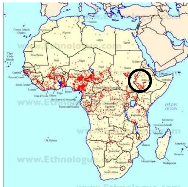
Map 2: the area of greatest linguistic diversity in Afroasiatic: the Cushitic and Omotic families ( Ethnologue ).