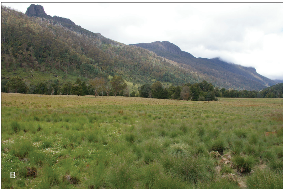
PLATE 1 — Examples of Tasmanian highland grasslands. A: long unburnt grassland exhibiting dense Poa tussocks and low abundance of interstitial species. B: Regularly burnt grassland. The area in the foreground has been burnt 1–2 years previously. Note space between Poa tussocks and abundance of forbs. The yellowish grassland patch in the left mid-ground has remained unburnt for longer.