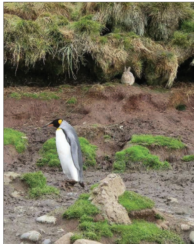
PLATE 7 — European Rabbit denuding the slopes of Macquarie Island prior to eradication.

Until recently, vertebrate control programs on islands have been largely ad-hoc with mixed success. However, over the past decade Tasmania has significantly improved its eradication methodologies with several now cited as exemplars of success. Pest management on Macquarie Island had systematically eradicated Weka Gallirallus australis by 1988, feral Cats by 2002, and finally Rabbits, Black Rat and House Mouse by 2014 in a multipronged multi-species approach (Springer 2018, pl. 7). Feral Cats have been eradicated from Tasman Island and Wedge Island (Robinson et al. 2015, Robinson & Gadd 2020), House Mouse from Fisher Island (S. Robinson, pers. com.) and Black Rat from Big Green Island (Robinson & Dick 2020) with planning underway on other islands. The Bruny Island Cat Management program commenced in mid-2016 and has already significantly reduced cat numbers aiming to meet the Commonwealth's target of being one of Australia's Five Cat Free Islands (Allan 2019). Several feasibility plans have been prepared for the removal of feral Pig Sus scrofa from Flinders Island, but none have yet to secure funding. The improved success of government-led eradication efforts has been largely due to a combination of