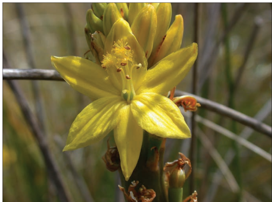
PLATE 6 — Island Leek Lilly Bulbine crassa , Neds Reef, near truwana-Cape Barren Island.

Islands are often regarded as stocking grounds for plants and animals declining elsewhere. Historically, several islands in Tasmania have had ad hoc releases such as Koala Phascolarctos cinereus , Forester Kangaroo Macropus giganteus and Cape Barren Geese Cereopsis novaehollandiae to Three Hummock Island (Bryant 2008) and Tasmanian Devil Sarcophilus harrisii to Badger Island in 1996 (DPIPWE 2010a). By