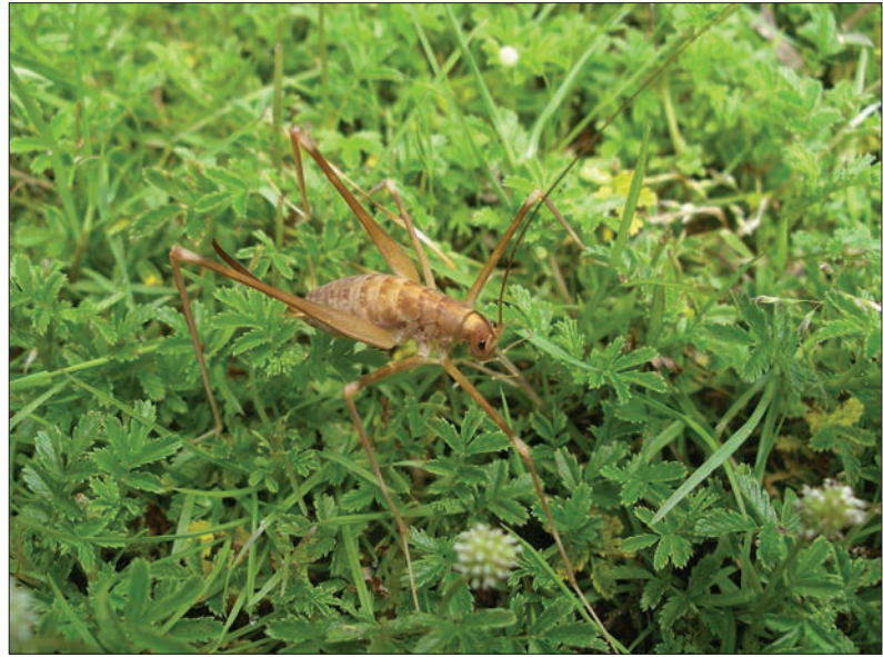
PLATE 3 — Rare Tasman Island Cricket Tasmanoplectron isolatum .

collection of invertebrates during their expeditions often focusing on threatened species or specific groups such as butterflies, grasshoppers, freshwater crayfish or molluscs, and invariably these surveys have resulted in new species finds and range expansions. For example, the invertebrate surveys conducted on Tasman Island identified a new snail species, Planilaoma? sp. nov. “Tasman Island”, a previously undescribed snail species, Pedicamista sp. “Southport”, and the lodgement of voucher specimens of the rare Tasman Island Cricket Tasmanoplectron isolatum (Bryant & Shaw 2006, pl. 3). New records of the molluscan Magilaoma penolensis and Scelidoropasp “Ridges Road” were made on Rodondo Island (Carlyon et al. 2015) and a species of stick insect was recorded for the first time in the eastern Bass Strait on Inner Sister Island (Harris & Reid 2011). Unique assemblages of troglobitic cave invertebrates occur on Flinders Island and range extensions for other species such as the endemic Furneaux Burrowing Crayfish Engaeus martigener and Fringed Heath-blue Butterfly Neolucia agricola insulana (NCHD 2014) have been made there. The discontinuation of integrated island survey programs has meant that invertebrates are now often overlooked during short-stay visits and this gap in knowledge concurs with Mesibov’s (2019) findings of a decrease in records of invertebrates lodged in museums and on databases since the turn of the century.