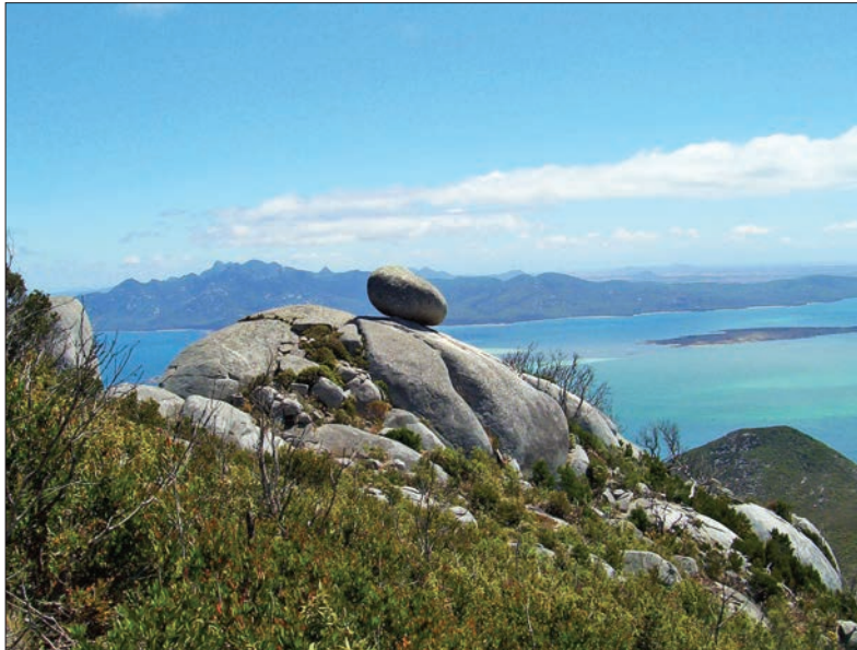
PLATE 4 — Northeast ridge on Mt Munro, truwuna-Cape Barren Island, looking across to Mount Strzelecki on Flinders Island.

islet (2.5 ha, pl. 5) is one of only three breeding sites for Endangered Shy Albatross Thalassarche cauta and critical habitat for the endemic Pedra Branca Skink Niveoscincus palfreymani , one of the rarest and most restricted reptiles in the world (Threatened Species Unit 2001).