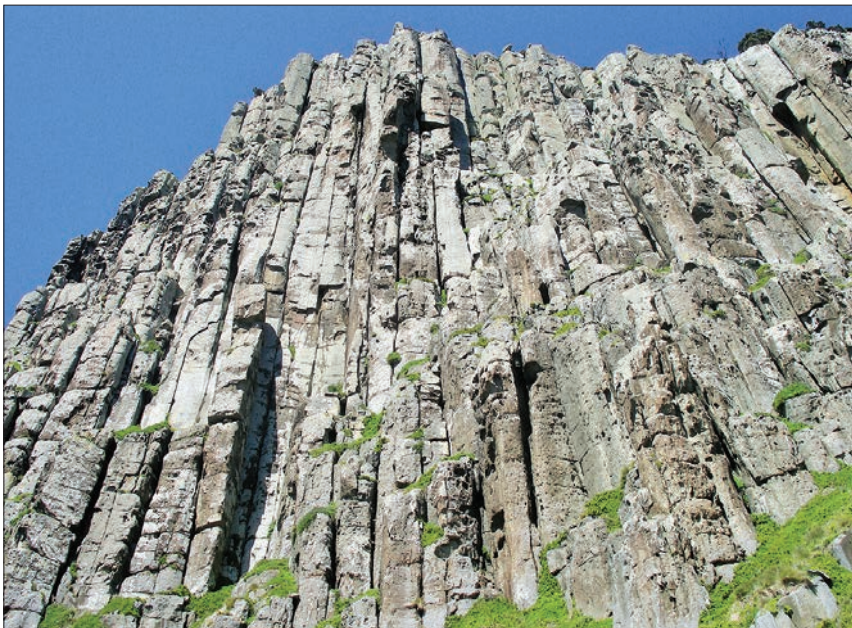
PLATE 2 — Dolerite structural columns on Tasman Island.

Over one third of Tasmania's land-based threatened fauna species occur on offshore islands (63 of 181 species, 35 %, appendix 1) demonstrating the significant role islands play in fauna conservation. Some islands are critical breeding sites or provide seasonal foraging habitat and some faunal groups, particularly island endemics or invertebrates, and found in only one island location. Even though the invertebrate values on Tasmania's offshore islands are becoming better known, this faunal group remains significantly under-surveyed. The coastal mollusc fauna on King Island contains at least 408 species with 78 being recorded for the first time by Grove and de Little (2014). Hamish Saunders Memorial Island surveys and Oil Spill Response surveys have targeted the