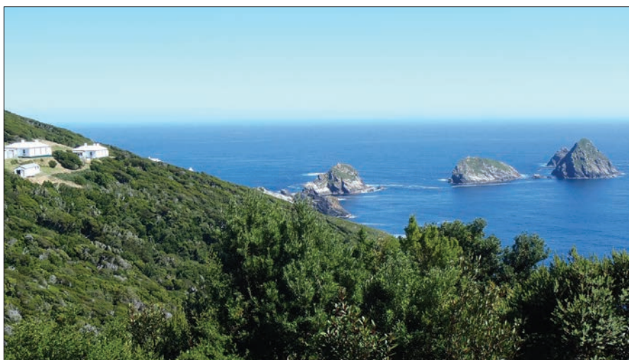
PLATE 1 — Maatsuyker Island showing lighthouse station and the Needle Rocks offshore.

islands, were all incorporated into the boundary of existing national parks whereas other islands transitioned in status over time from unallocated Crown land or private lease, to Game Reserve, Conservation Area or Nature Reserve depending on their values. Macquarie Island, including Judge and Clerk and Bishop and Clerk islets, was proclaimed a Wildlife Sanctuary in 1933, a Conservation Area in 1971, State Reserve in 1972, Nature Reserve in 1978 and in 1997 was inscribed on the World Heritage List (PWS 2006) with its boundaries extended several times since to incorporate marine reserves. The Tasmanian Wilderness World Heritage Area incorporates numerous islands around the southwest coast, the larger being the Maatsuyker Island Group, De Witt, Ile du Golfe, Louisa Island, Hen and Chicken Islands, Pedra Branca, Mewstone, Eddystone Rock, Trumpeter Islet, Muttonbird Island, Breaksea Island and the Swainson Group (DPIPWE 2016).