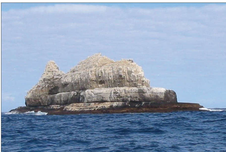
PLATE 5 — Pedra Branca Islet located ~ 27 km off South East Cape.

Tasmania's islands are central to the ecology of all our land-breeding marine vertebrates including globally threatened albatrosses, giant petrel and burrowing seabird species and seal species (Bryant & Jackson 1999). Over 60 species of seabird including massive aggregations of Short-tailed Shearwater Ardenna tenuirostris and Little Penguin Eudyptula minor breed on the Bass Strait islands, including those in the Hogan Group (Brothers et al. 2001, Carlyon et al. 2011). Sub-Antarctic Macquarie Island has an estimated biomass of 3.5 million breeding seabirds, predominantly penguins with some (e.g., Royal Penguin Eudyptes schlegeli , Macquarie Island Shag Leucocarbo purpurascens and several species of burrowing petrel) breeding only there (Bryant & Shaw 2007, Terauds & Stewart 2009).