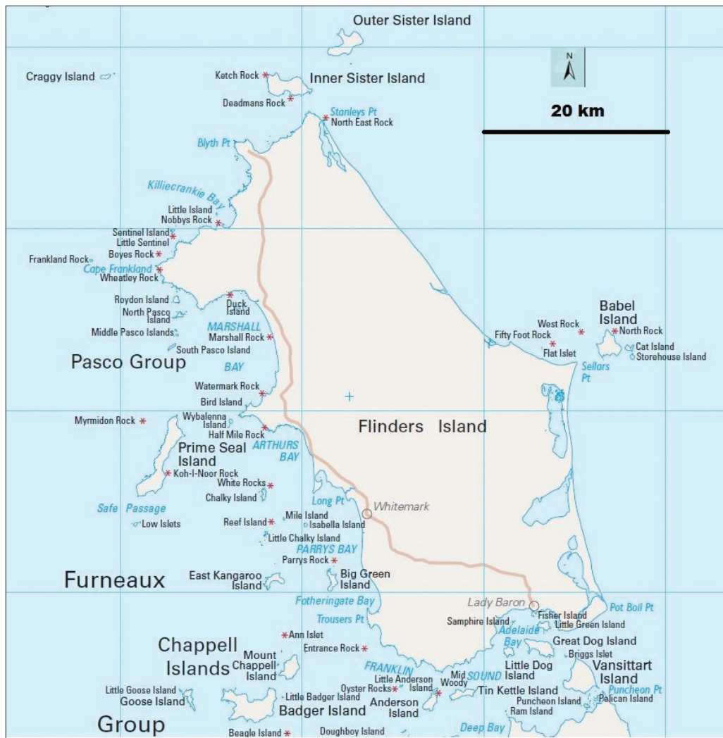
FIGURE 1 — Flinders Island showing density of surrounding islands.

From the 1970s onwards Tasmania's offshore islands were systematically reviewed for statutory protection. Maria, Schouten, Tasman, South Bruny and the Kent Group of