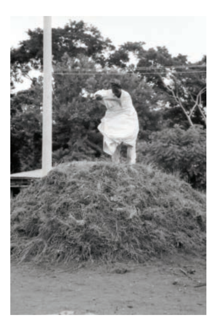
4 Àwòrò dancing on the larger mound (esin). Ikùn-Oba, 1990.

The festival at Ikùn-Qba that Allison's photographs document takes place every second year in July. As with many of the major festivals belonging to the towns of Ekiti, it is said to mark the new yam harvest. The festival itself celebrates the figure of Egbùrù, a deity variously described to me as an epa, an òrìṣà, an ancestor of the town, a great warrior. The most common term used, however, when describing Egbùrù was ìmólè. The term may encompass much of the above description, but the notion of imólè requires further disentangling (see below). Cults celebrating Egbùrù are not confined to this precise locale and are found throughout eastern and northern Ekiti; the name may be synonymous with, or a homonym for, cults such as Agbùrù or Areù. In Ikùn, however, Egbùrù