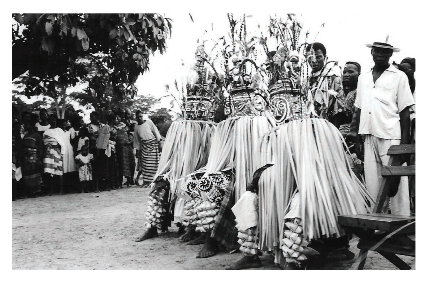
Epa-type masks, Ikùn Ōba Phillip Allison Archive, Weston Library, University of Oxford