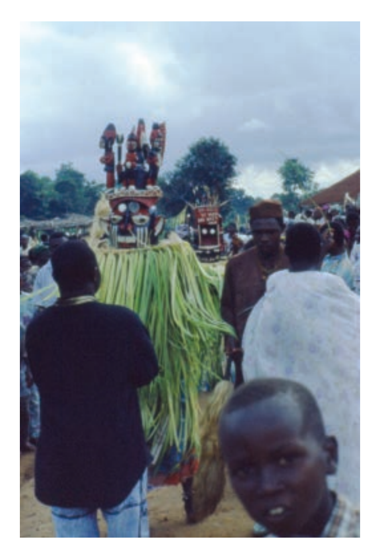
Olomoyóyó and Egbùrù in Ilaşa. 1991.

(1954, 1962, 1966) suggested that towns were the outcome and expression of domestic social organization; localized agnatic lineages serving as the dominant segmentary building blocks within towns. Lloyd proposes that, from this basic organization, complex kingdoms developed.