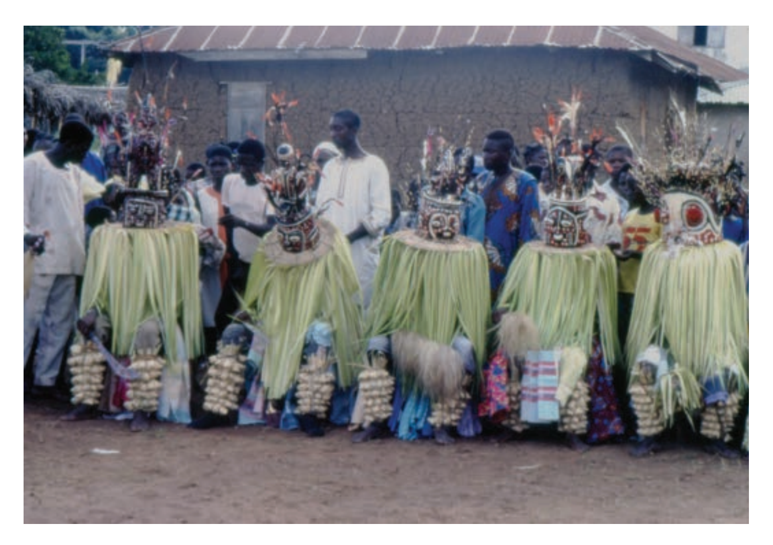
The seated Egbùrù and accompanying masks. Ikùn-Qba, 1990.