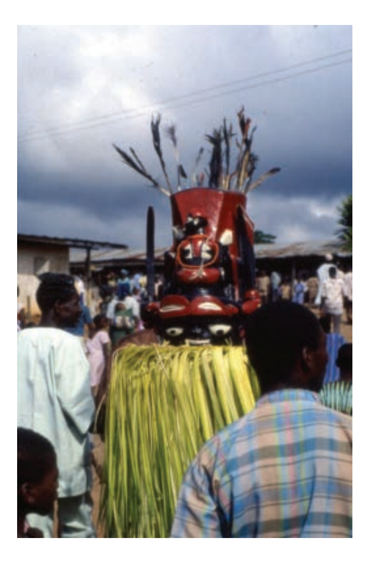
11 Egbùrù in Ilașa: rear view. 1991.

Epa-type masks when he categorizes them under his Type III: masks that create dramatic distance, but which may be regarded as literal embodiments of metaphysical powers. The thing itself is where the energies lie. "What matters in this case is the visible tangible reality of the artefact. The mask reveals rather than conceals" (Picton 1990: 193).