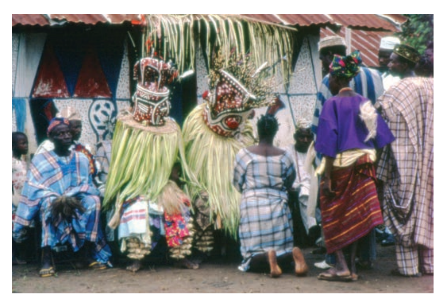
Woman petitioning the seated Egbùrù. Ikùn-Oba, 1990.

These differences in mask morphology are also reflected in differences in performance. Ilasa's festival is less structured than that of Ikùn Oba. Early in the morning, sacrifice is made over the masks (as objects) and they are then taken into the forest. In the early afternoon the masks appear together, arriving from the bush along one of the central farm roads, passing under the familiar palmfronded gateway. However, rather than entering the town directly, they deviate into the interstitial back streets of Iro quarter, working through the narrow "loins" (passages) between compounds, until emerging at the central road of Iro.8 A large crowd welcomes them.