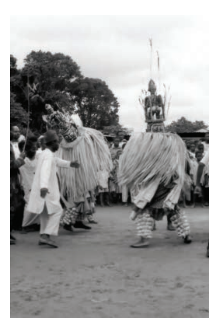
5 Elese and Olomoyóyó masks dancing. Ikùn-Qba,

blast on a horn "trumpet" announces the beginning of the festival. Immediately two further àwòrò come from the bush, carrying a sheet that covers the head of a small child running between them. The child is hurried to the shrine house, which he enters, and is not seen until the very end of the day. This is the alágbálé, the child that "sweeps the road" for his elders, but is also a symbolic marker of the relationship between the festival and its place in fertility rites.