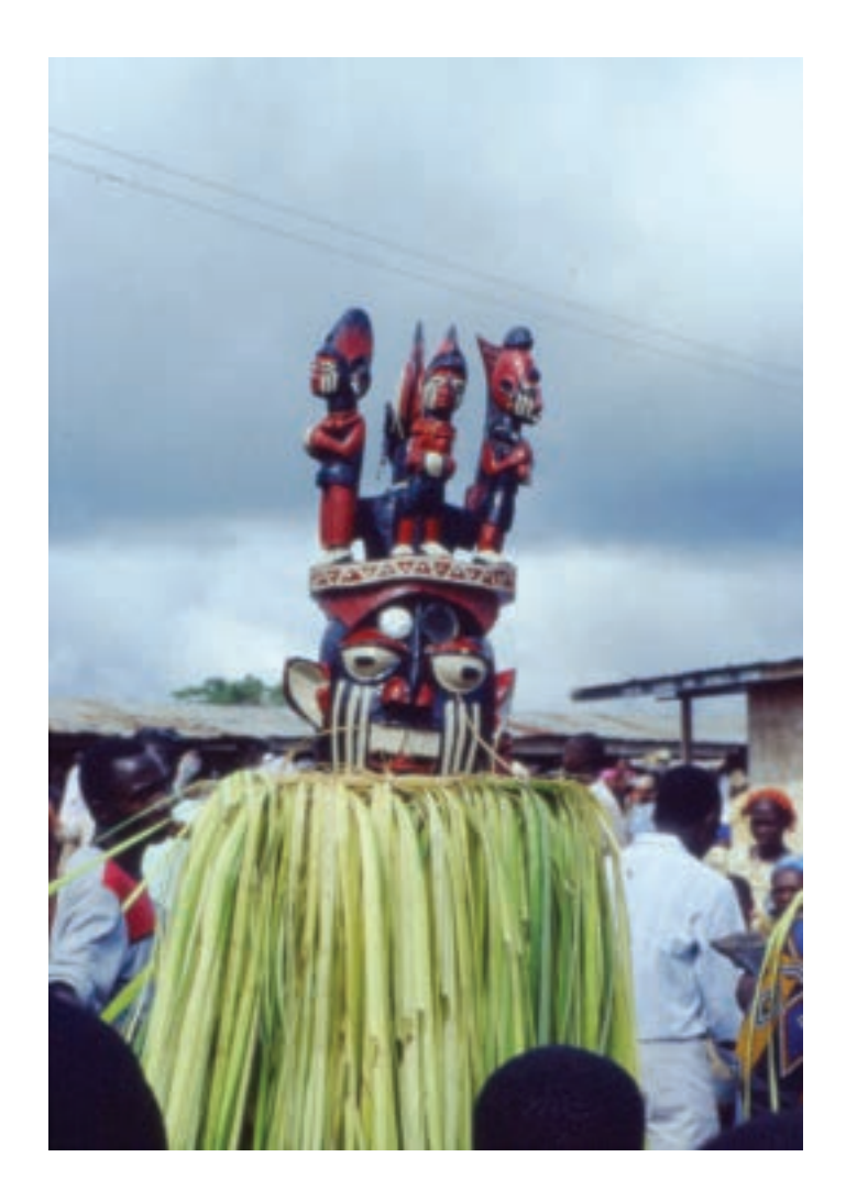
10 Olomoyóyó in Ilaşa: rear view. 1991.

Egbùrù (as with Epa, Elefon, Agùrù, et al) is described as ìmólè . Abrahams (1962) defines ìmólè as earth spirits, a notion that has had a fairly wide airing in literature about the Yorùbá, in which the notion of ìmólè (or ùmólè ) has tended to refer to a form of primordial deity. Idowu suggests (1962: 61) that ìmólè offers a contraction of Emo tí mbe n'île , "the supernormal beings of the earth." The name he suggests connotes awesomeness, eeriness, the mysterium tremendum in distinction to the "somewhat prosaic and homely" òrìṣà . Idowu goes onto argue that the word is "a designation for the dreadful ones whose habitations were the thick dark groves and unusual places: those who walk the world of men at night and prowl the place at noonday; the very thought of whom was hair-raising"