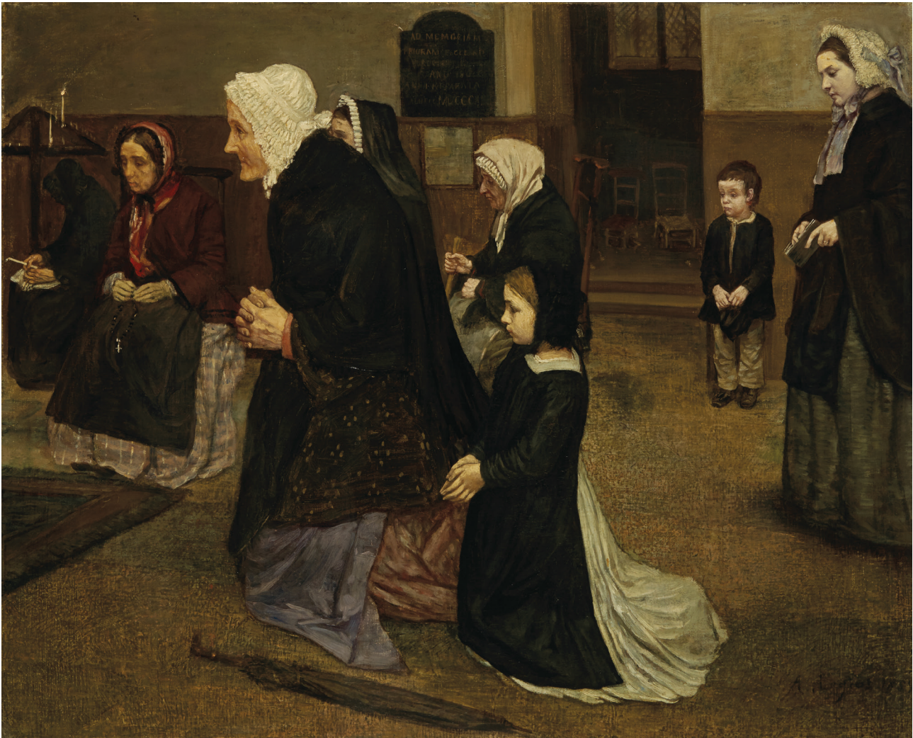
10 Alphonse Legros, L'Angélus [ The Angelus ], 1859. Oil on canvas, 65.5 x 80.9 cm. Private collection.

that Baudelaire specifically mentioned: 'all that little world, clothed in corduroy [...] and cotton, which the Angelus assembles in the evening under the church vaults of our great cities, with their clogs and their umbrellas'. 59