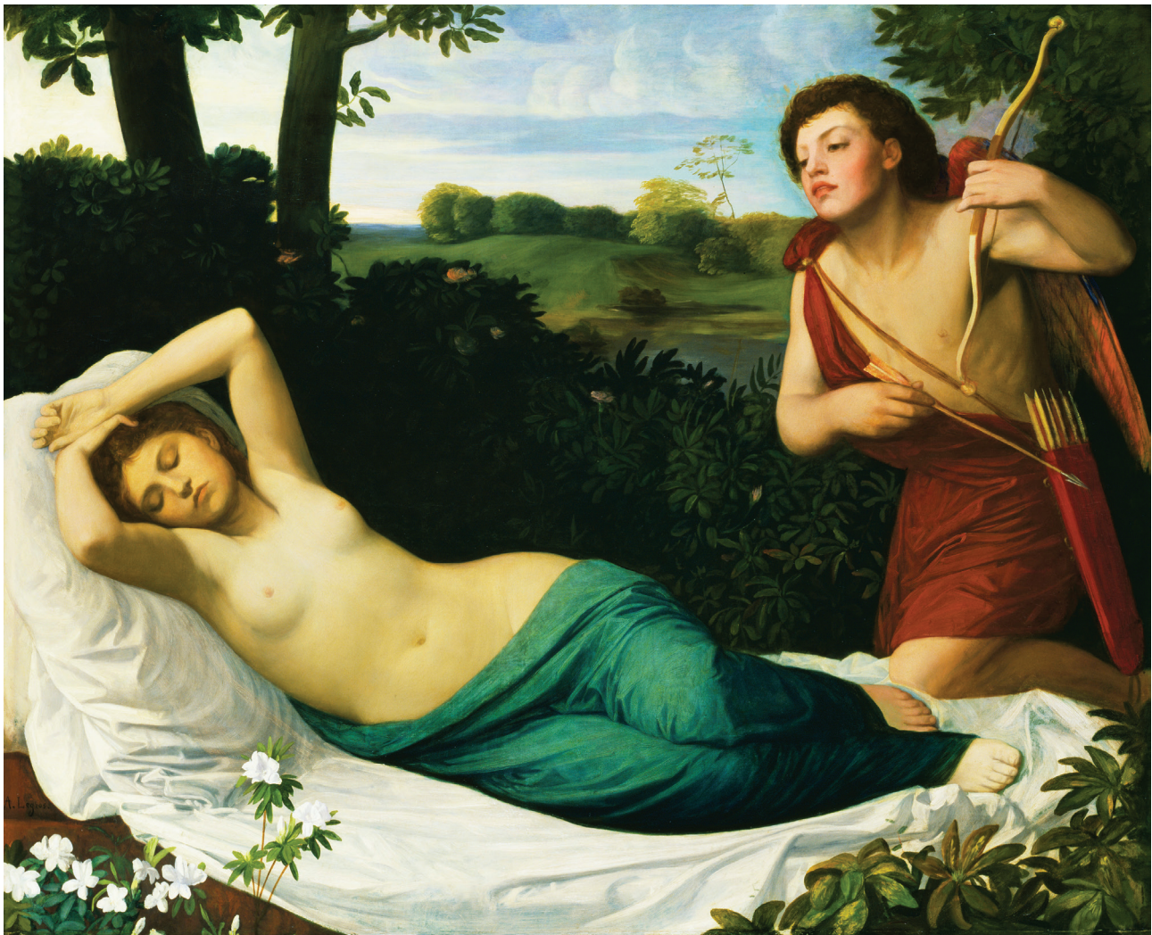
7 Alphonse Legros, Cupid and Psyche , 1867. Oil on canvas, 116.8 × 141.4 cm. London: Tate.

As in the previous case, it may be more interesting to triangulate. At the Old Water-Colour Society exhibition of 1867, Edward Burne-Jones showed two compositions of a nude Psyche: one close in subject to Legros's, Cupid Finding Psyche as she sleeps (a