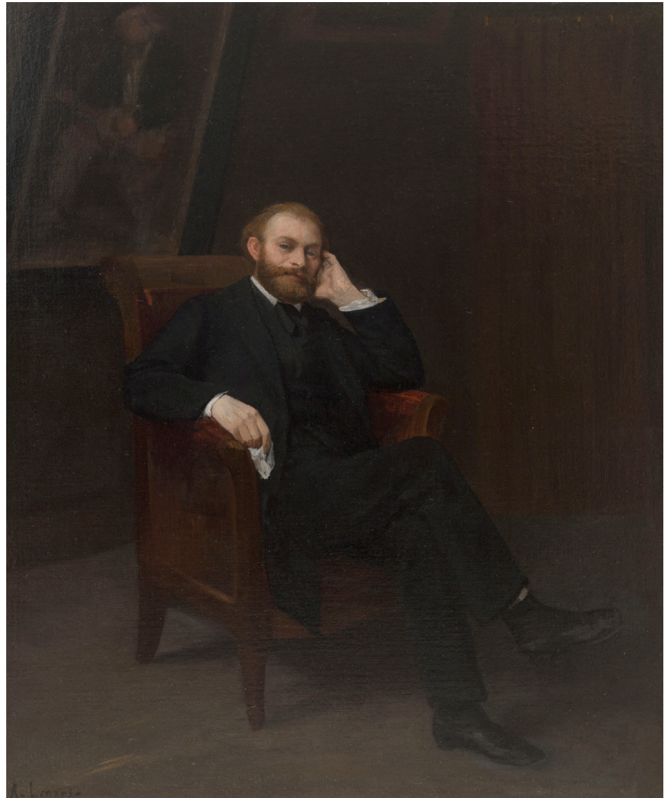
6 Alphonse Legros, Portrait de E. M. [Édouard Manet], 1863. Oil on canvas, 61.5 × 50 cm. Paris: Petit Palais (Musée des Beaux-arts de la Ville de Paris).

Fried is surely right to emphasize the tight network of relationships, circa 1863, among Manet, Fantin, Whistler, and Legros, and the significance of that network for the development of vanguard painting in Paris over the next years. What he does not, or cannot, acknowledge, however, is the transformative effect of contact with the London art world at that crucial moment. By the end of the year that gives Fried the name for his grouping – 1863 – Whistler and Legros had both relocated to London. Fantin could not be persuaded to emigrate, but he was increasingly making work for