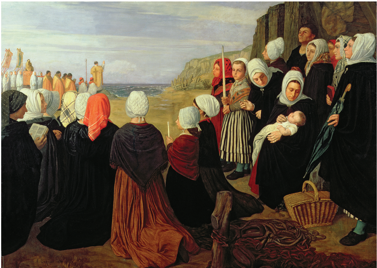
12 Alphonse Legros, La Bénédiction de la mer [ The Blessing of the Sea ], 1872. Oil on canvas, 179.5 × 243.3 cm. Sheffield: Graves Art Gallery.