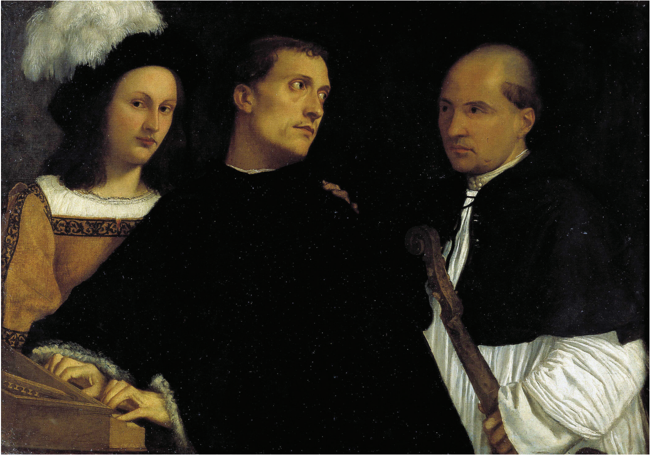
14 Titian, The Concert , c. 1510–12. Oil on canvas, 86.5 × 123.5 cm. Florence: Galleria Palatina di Palazzo Pitti.