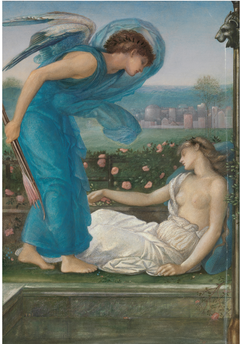
8 Edward Burne-Jones, Cupid and Psyche , c. 1870. Watercolour, gouache, and pastel on paper, mounted on linen, 70.2 x 48.3 cm. New Haven: Yale Center for British Art.

version of plate 8); the other representing a later episode in the tale, Cupid Delivering Psyche from her deathly slumber after she has opened the forbidden casket in defiance of the gods. 31 There is a realist tangibility about Legros's painting of both flesh and foliage that contrasts with the more ethereal watercolours of Burne-Jones, and appeared French to London critics. 32 Legros's Cupid also resembles contemporary male figures by Solomon, although again solidier in flesh and blood. There is, however, another French connection: just three years earlier, Courbet designed a composition of two female nudes, submitted to the Salon as Étude de femmes (and rejected, apparently for moral reasons) but understood in artistic circles to represent an imagined encounter between a jealous Venus and the sleeping Psyche. 33