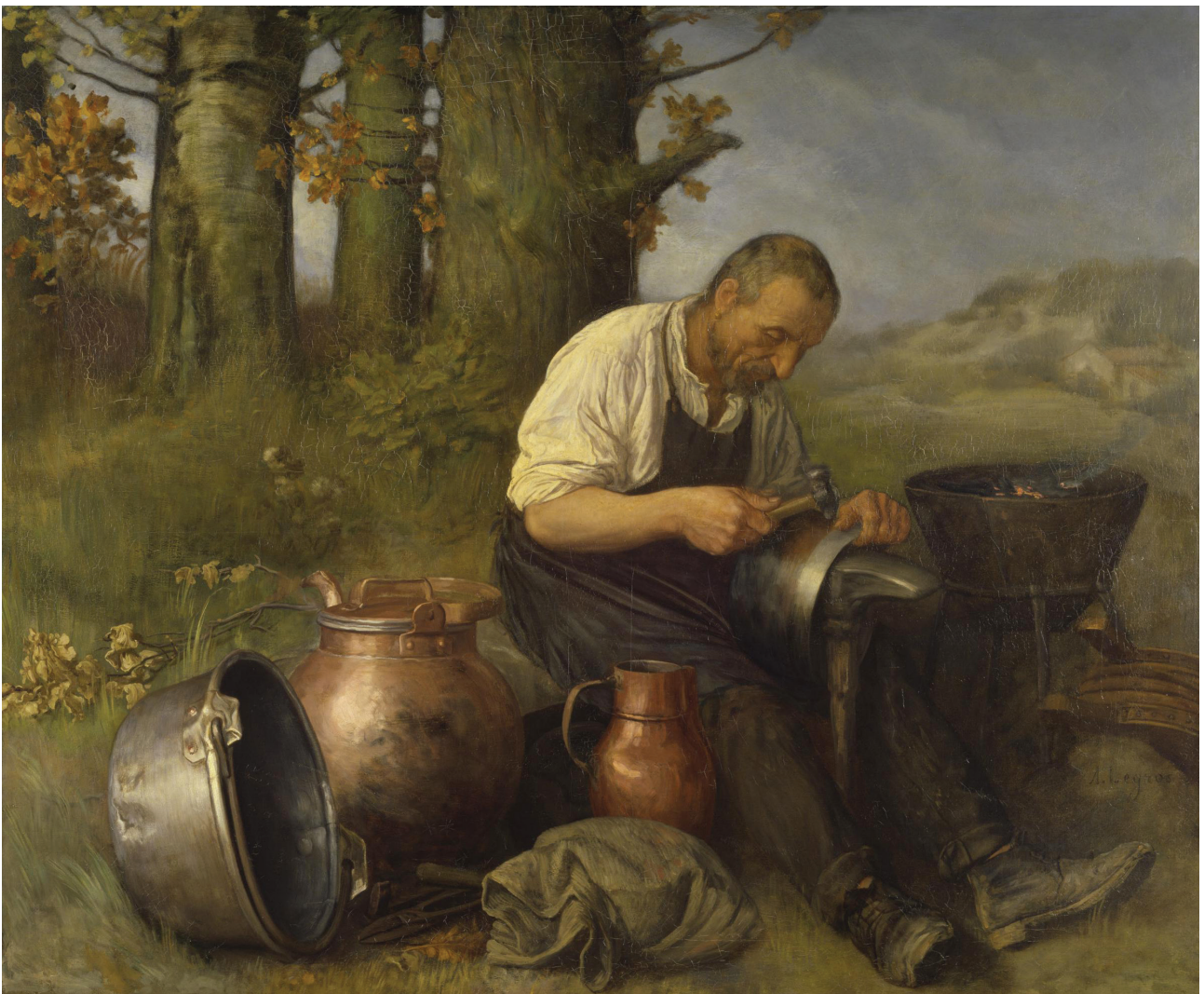
9 Alphonse Legros, Un Chaudronnier [A Tinker], 1874. Oil on canvas, 115 × 132.5 cm. London: Victoria and Albert Museum.

This is a reminder that the visual arts are in some sense a universal language, that they have the utopian potential, at least, to create communication between people who cannot understand each other's words. However, I should like to argue that it also relates closely to what might be called a theoretical tenet of English aestheticism as an artistic movement: its rejection of any content that can be paraphrased in words – or, put more positively, its love of the ineffable. As Swinburne said of a painting by Albert Moore: 'its meaning is beauty; and its reason for being is to be'; 50 the apparently tautologous slogan 'art for art's sake' follows suit. I have argued elsewhere that this redundant phraseology is not just aesthetic mystification or highfalutin jargon. 51 Rather it represents a serious ambition to make art that cannot be reduced to rule or precept, but instead allows for that genuinely free play of the sensuous and the intellectual that can give the thrill of beauty. 52 Legros's Chaudronnier makes as good an example as any: no one would call this man beautiful, with his rough shoes and battered pots, and even the landscape is fairly unremarkable. Yet I am confident in calling the painting beautiful,