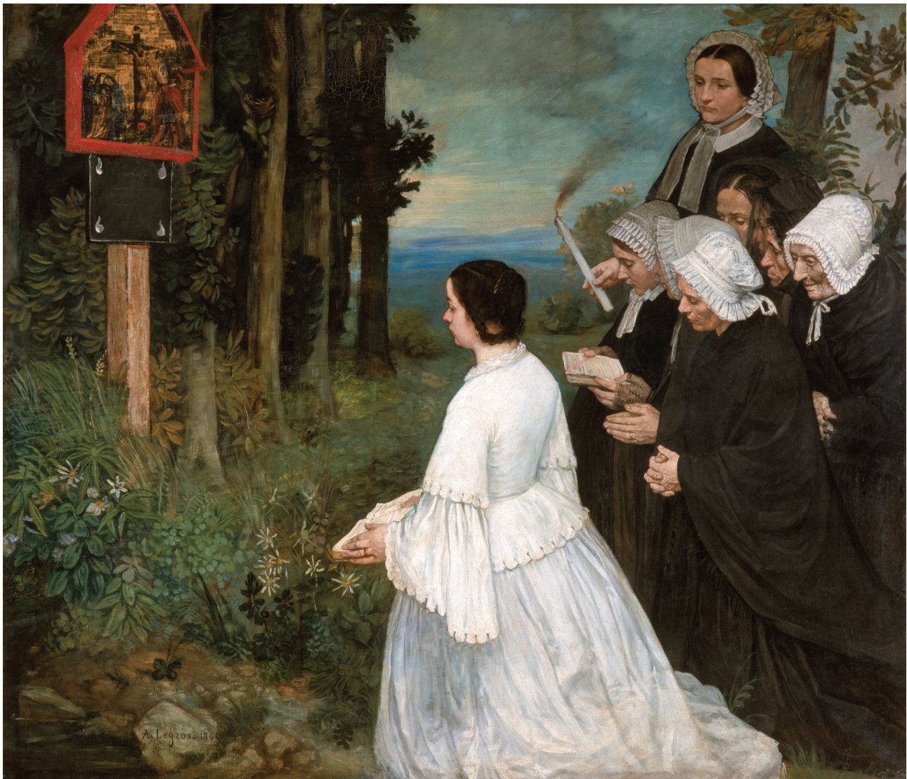
5 Alphonse Legros, Ex Voto, 1860–61. Oil on canvas, 174 × 197 cm. Dijon: Musée des Beaux-Arts de Dijon.

No doubt William was determined to help Legros establish himself in England, in concert with his brother Dante Gabriel Rossetti, who introduced Legros to his own patrons. There is no reason, however, to doubt the sincerity of William's puff. Moreover, Rossetti's approbation was shared by other critics who had less reason to be partisan, and frequently repeated in subsequent years. 19