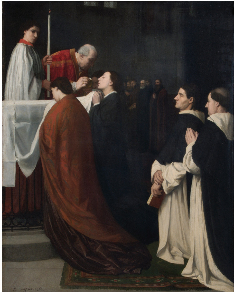
1 Alphonse Legros, The Communion , 1865. Oil on canvas, 88.9 × 76.2 cm. Walthamstow: William Morris Gallery.

century this apparent retreat from modernity signified, almost automatically, a loss of vigour or grit, a dereliction of avant-garde duty.