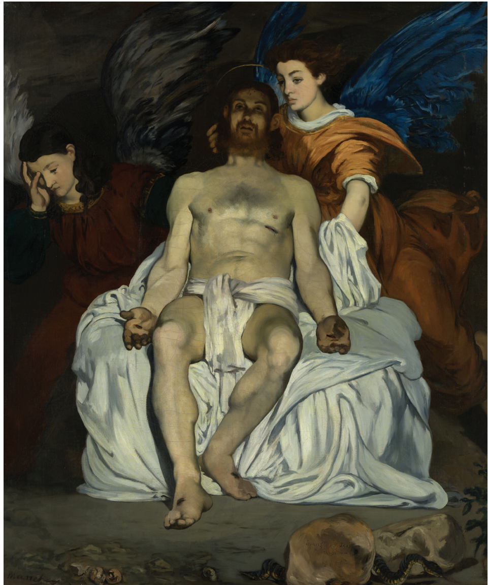
4 Édouard Manet, Les anges au tombeau du Christ [ The Angels at the Tomb of Christ ], 1864. Oil on canvas, 179.4 × 149.9 cm. New York: Metropolitan Museum of Art (H. O. Havemeyer Collection).

women are under supervision is strong, and that again is something that might make viewers uncomfortable – viewers who mistrust religious authority as well as those uneasy about the subjection of women.