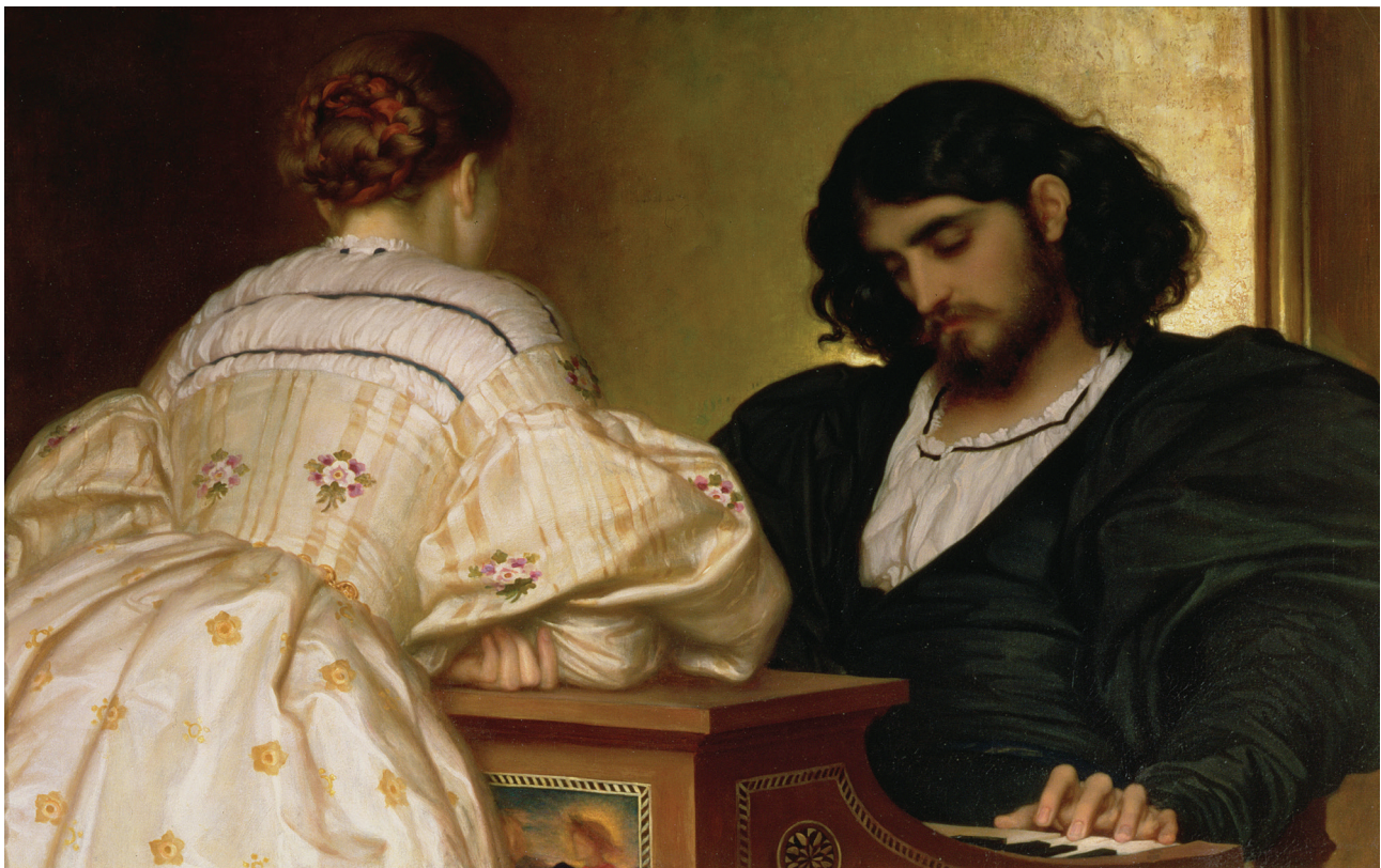
15 Frederic Leighton, Golden Hours , 1864. Oil on canvas, 91.5 × 122 cm. Private collection.

The allusions in Ex Voto are diverse in time, place, and cultural level, but they are not eclectic: all of them are precisely motivated to support or extend the visual and intellectual meanings of the painting. At this date, they also operate within a primarily French