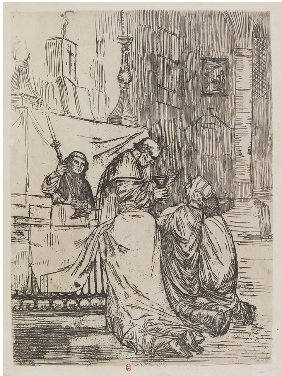
2 Alphonse Legros, La communion dans l'église Saint-Médard [ Communion in the Church of St Médard ], 1861. Etching (first state), 36.2 × 26.8 cm. Paris: Bibliothèque nationale de France (Département estampes et photographie).