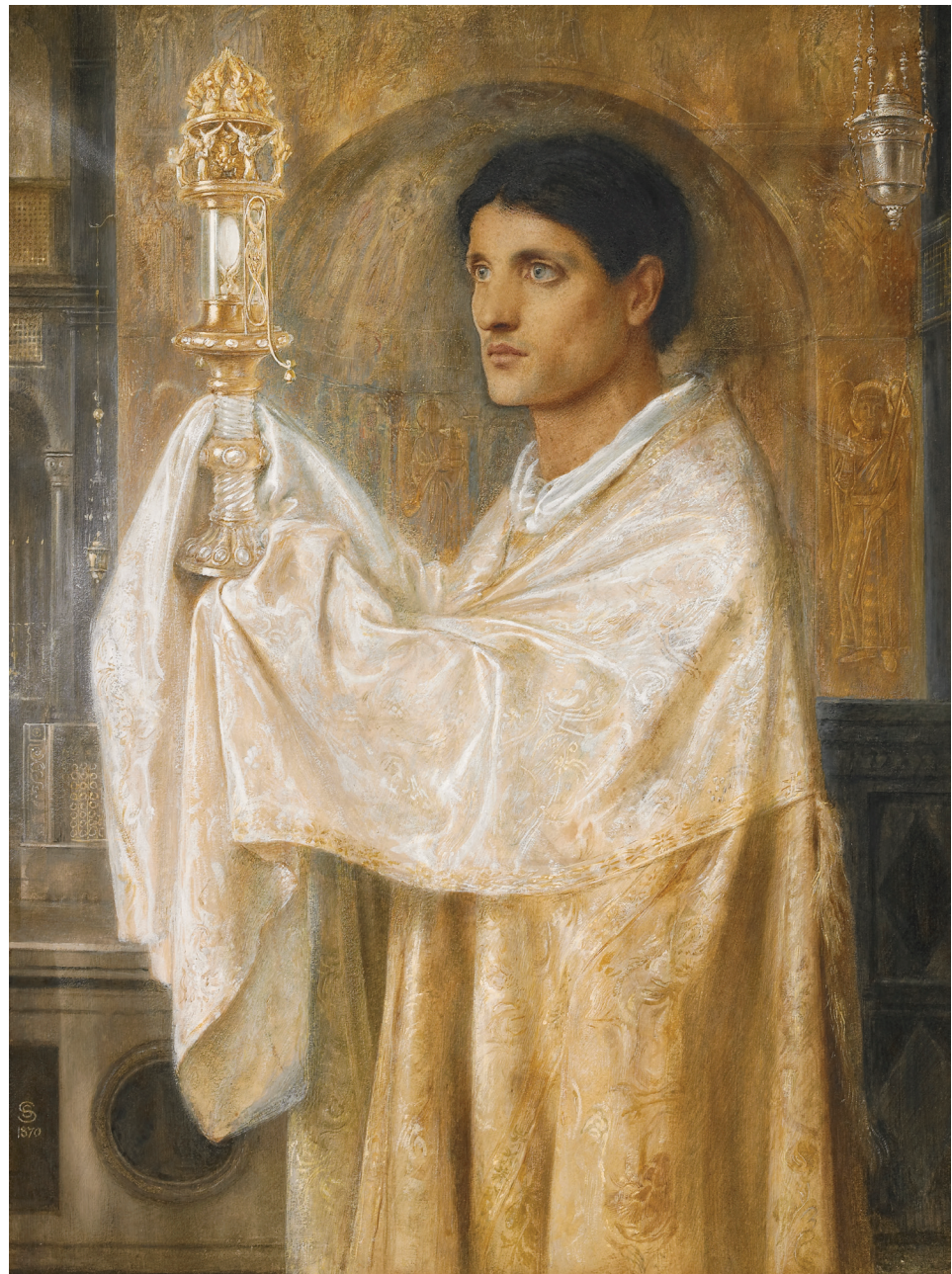
3 Simeon Solomon, The Mystery of Faith , 1870. Watercolour on paper, 50.8 × 38 cm. Port Sunlight: Lady Lever Art Gallery.

human eyes through an absence. In the Legros the wafer also marks the point of incipient contact between the fleshy hand of the priest, on which a gold ring glints, and the woman's lips, tilted upwards in anticipation. This conjunction, too, might make some viewers uncomfortable, and the more so as there is no actual contact. The woman's religious submission is entirely contained within her own body, but it is also powerfully sensualized: her eyelids are lowered to rivet her gaze on the wafer as it approaches her lips, slightly pallid yet full and just about to part, as her hands grasp the pure white linen of the cloth, which the nearer woman brings close to her lips, in reverence. 6 Is it important that the three figures kneeling at the communion rail are women – a kind of female trinity – but all the others men? They surround the women, with priest and acolyte looming over them, two Dominican friars guarding their backs, and a group of robed figures quite far back, but perhaps the more menacing as they mass, silently, in the distant reaches of the church interior. The sense that the