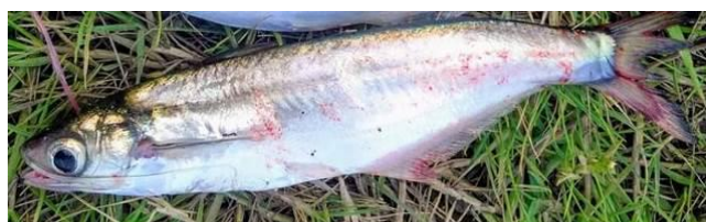
Figure 3. Laides hexanema . First record for Brantas River, East Java, Indonesia (Stations 3 and 4)