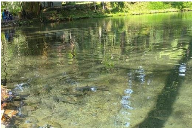
Figure 5. Mahseers ( Neolissochilus and Tor ) schooling in the spring of Brantas River, East Java, Indonesia (station 1)