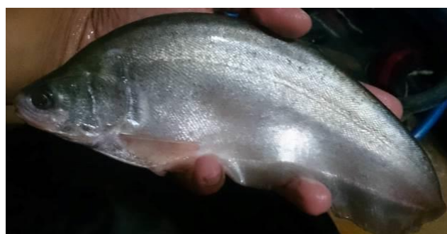
Figure 4. Notopterus notopterus . A protected species from Brantas River, East Java, Indonesia (Stations 2, 3, and 4)