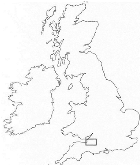
Figure 1. Location of the Mendip Hills, redrawn by A. Chamberlain from original drawings supplied by the author.

The Mendip Hills lie in the northern part of the county of Somerset in southwest England (see Figures 1 and 2).