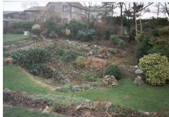
Figure 5. Castle Farm Swallet: a swallet converted into a decorative garden feature!

1977: 222). However, Mendip itself has never been overrun by ice. Swallets range in diameter from a few metres across to nearly 30 metres. It is difficult to gauge their true depth from surface observation as they become naturally infilled and can appear as shallow depressions, only a few metres or less in depth. Unfortunately, many have also been deliberately filled and levelled, a convenient dump for rusting farm machinery, cars, fridges and, undoubtedly, the ubiquitous shopping trolley (Figure 4). Castle Farm Swallet has even been made into a garden feature (Figure 5). Nonetheless, excavation has shown that swallets can attain depths of at least 20 metres (Levitan et al., 1988).