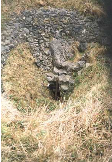
Figure 11. Entrance to Brimble Pit Swallet, photograph by the author.

The southern shaft (Figure 11 below) was excavated by Stanton to a depth of -8 metres and found to contain over 200 pieces of flint, animal bones showing evidence of butchery, human bone and 42 sherds of Grooved Ware pottery. The analysis of the site is still underway (Lewis et al. forthcoming) but it would appear that this is another example of a swallet being used as a receptacle for deliberate deposition. It is possible to make preliminary statements about some of the material.