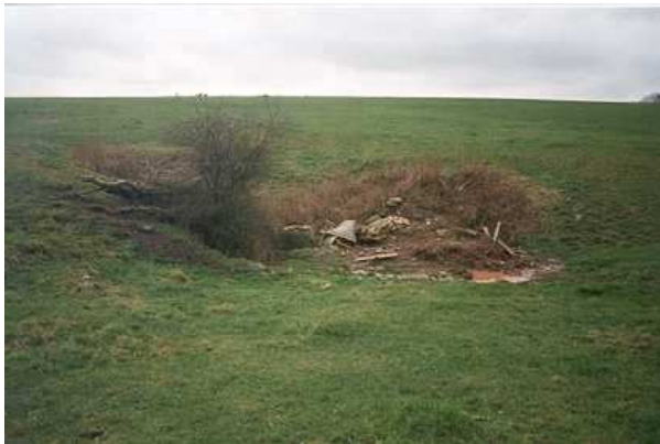
Figure 4. Ubley Warren: a swallet filled with rubbish.

Swallets are formed by dissolutional activity and sometimes, very rarely, by ground collapse into an underlying cave system (Barrington & Stanton 1977: 222-223). Many swallets occur at the junction of the impermeable Old Red Sandstone and the free-draining limestone; water enters cracks & fissures in the limestone that become enlarged and form swallets. They also form in valley floors, dry valleys and where clay caps the limestone (Barrington & Stanton 1977: 222). In the latter case, water will find leakage points in the clay, eventually causing a depression in the limestone into which the clay slumps. Swallets develop and deepen during warm interglacials but in ice ages they become filled and obliterated (Barrington & Stanton