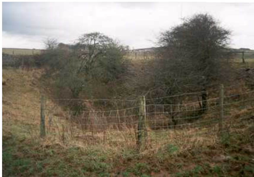
Figure 3. Cuckoo Cleeves: a typical Mendip swallet, photograph by the author.

Swallets occur in their thousands over the Mendip plateau (Figure 3). Upon excavation, many have revealed themselves as vertical shafts in the limestone. It is important to distinguish those closed depressions that are man-made from those that are natural. The man-made examples are a result of mining and quarrying and are usually distinguishable by their irregular form and the presence of spoil around them. Once these are discounted, it is probable that the remaining examples are all natural.