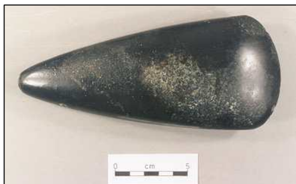
Figure 10. Polished stone axe from Brimble Pit Swallet, drawing by David Mullin.