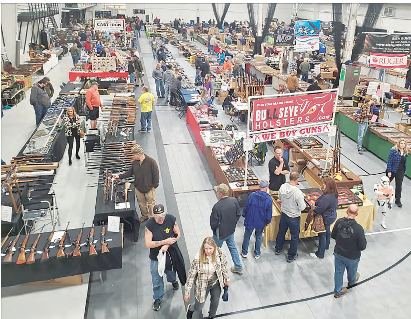
Kraus Promotions Gun Show.