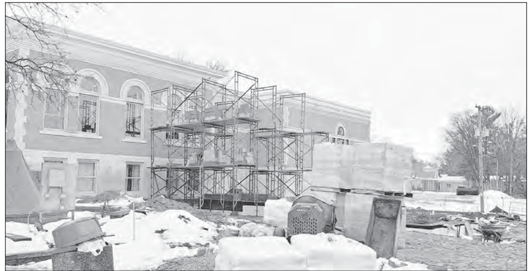
The new addition for the Sparta Free Library is going up on the eastern side of the building. The new elevator will be located where the scaffolding is located in this photo. Currently, the conditions are very muddy, but Director, Michelle Tryggestad says that rain is better than frigid temperatures, for the continuation of the expansive project.

Tryggestad also brought up the new Discovery Zone, which will be sponsored in part by Kwik Trip and by the Shovelmen. "We will have a dedicated area where kids can explore and discover many different things, including career paths. Currently, we only have a movable shop front, where we swap out different things for them [the kids] to look at."