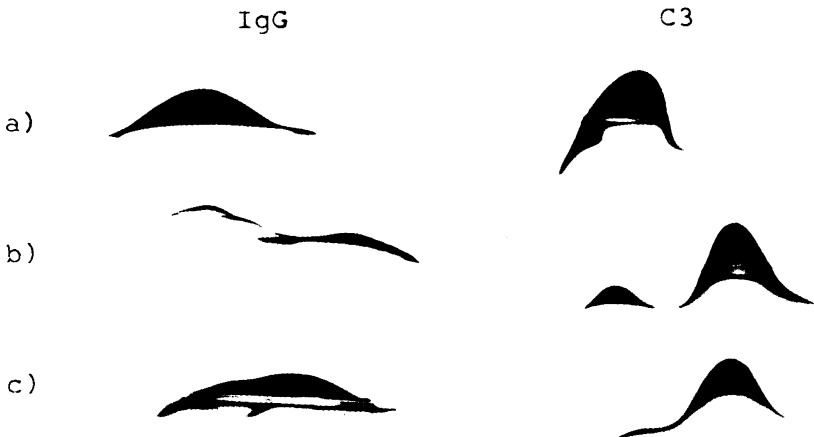
Figure 3. Crossed immunoelectrophoresis for IgG and C3 a) patient's serum b) moderate peritonitis exudate c) severe purulent peritonitis exudate The peaks to the right reveal split products of lower molecular weight.

For further investigation of the apparent dysfunction of opsonins in peritonitis exudates the immunological integrity of IgG and C3 was studied by crossed immunoelectrophoresis (Fig.1).