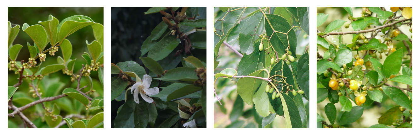
Brevi-deciduous trees[left to right]: Diospyros chloroxylon, Pterospermum suberifolium, Cassine glauca, Streblus asper