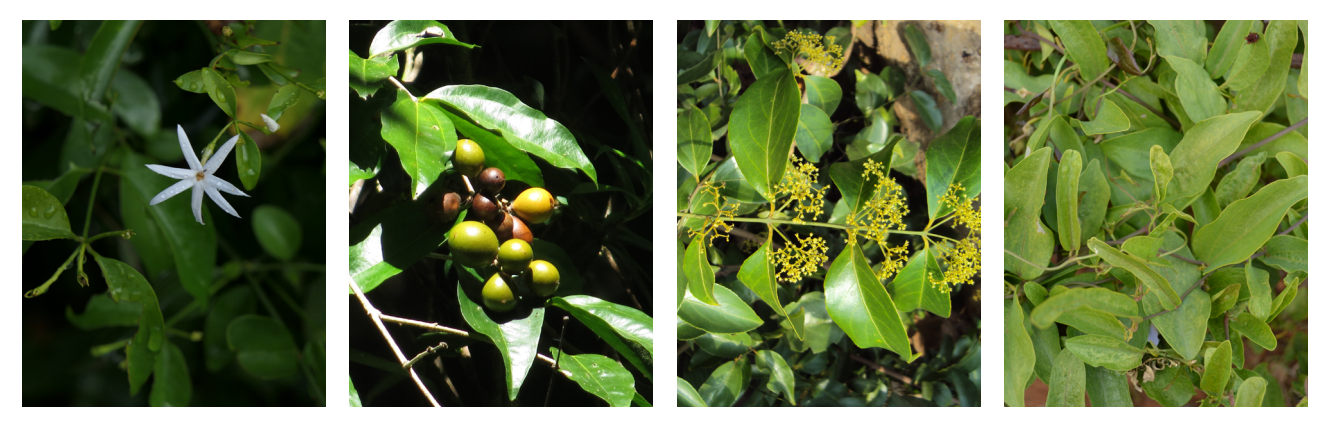
Climbers[left to right]: Jasminum angustifolium, Strychnos minor, Reissantia indica, Aristolochia indica