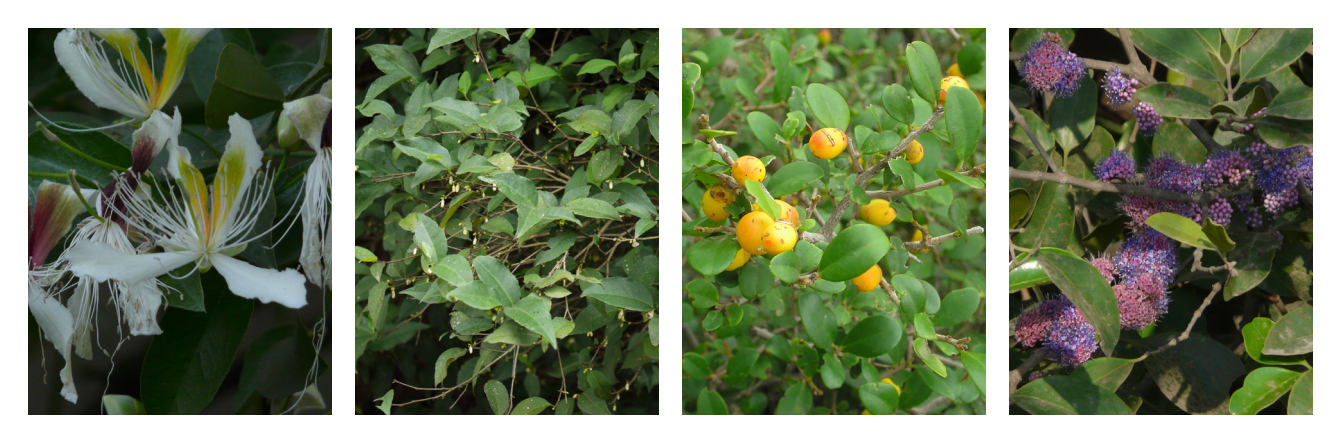
Shrubs[left to right]: Capparis brevispina, Dimorphocalyx glabellus, Diospyros ferrea var. Buxifolia, Memecylon umbellatum