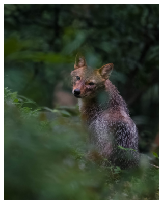
Left to right: Bamboo Pit Viper, Blue throated flycatcher, Green Forest Calotes, Golden Jackal