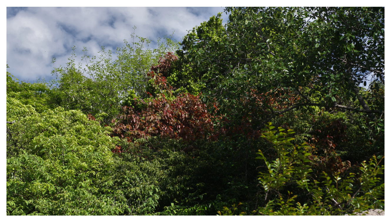
An example of a dry evergreen canopy near Pondicherry

Bamboos are usually absent, grass and herbs are present but not abundant in the dark understorey. Brevi-deciduous species are those that lack an inherent seasonality in leaf-shedding, or in having a completely bare canopy for a period. They retain