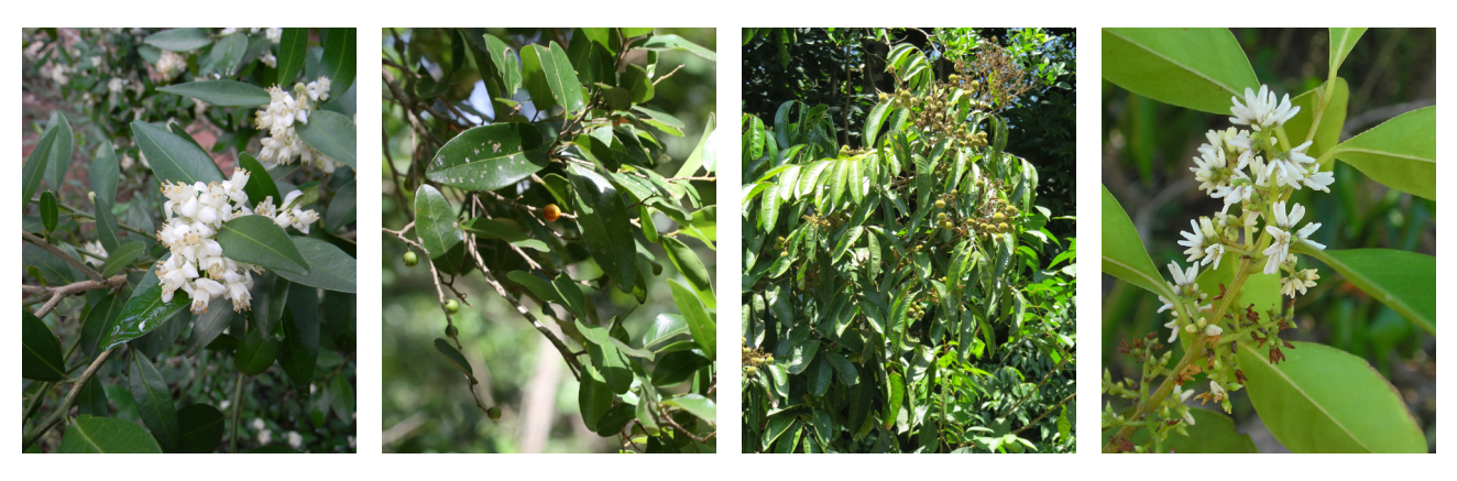
Evergreen trees[left to right]: Atalantia racemosa, Drypetes sepiaria, Lepisanthes tetraphylla, Chionanthus Zeylanica