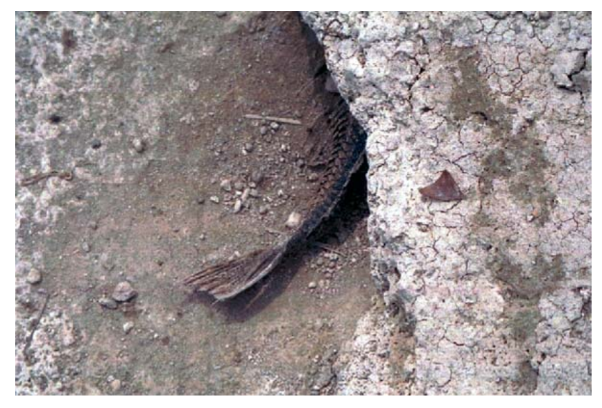
Figure 6. Sailfin catfish in de-watered burrow