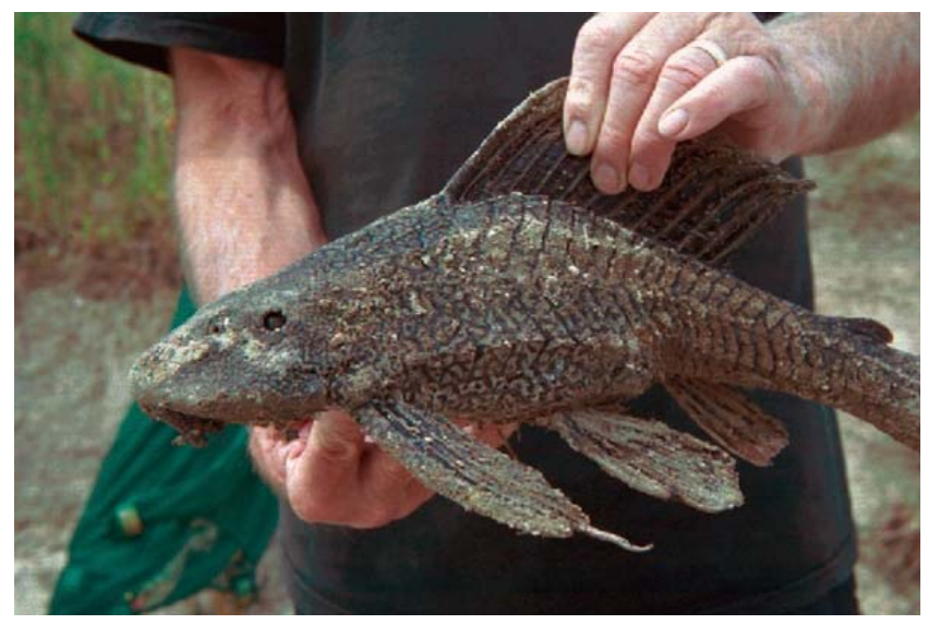
Figure 7. Sailfin catfish extracted from de-watered burrow. Eyes are sunken into the sockets and surface is dry to touch indicating prolonged aerial exposure. Specimen recovered, however, when returned to the river, ventilating and moving almost immediately, and swimming off into deep water several minutes later

Native herbivorous North American fishes, like the central stoneroller ( Campostoma anomalum ) and the Florida flagfish ( Jordanella floridae ), are small (less than12 cm) minnows or minnow-like fishes, with comparatively short lifespans (less than 4 years), low fecundity, and limited resistance to hypoxia and desiccation (Figure 8). Consequently, they are at a competitive disadvantage when confronted by larger (greater than 15 cm), longer-lived, highly productive, environ-