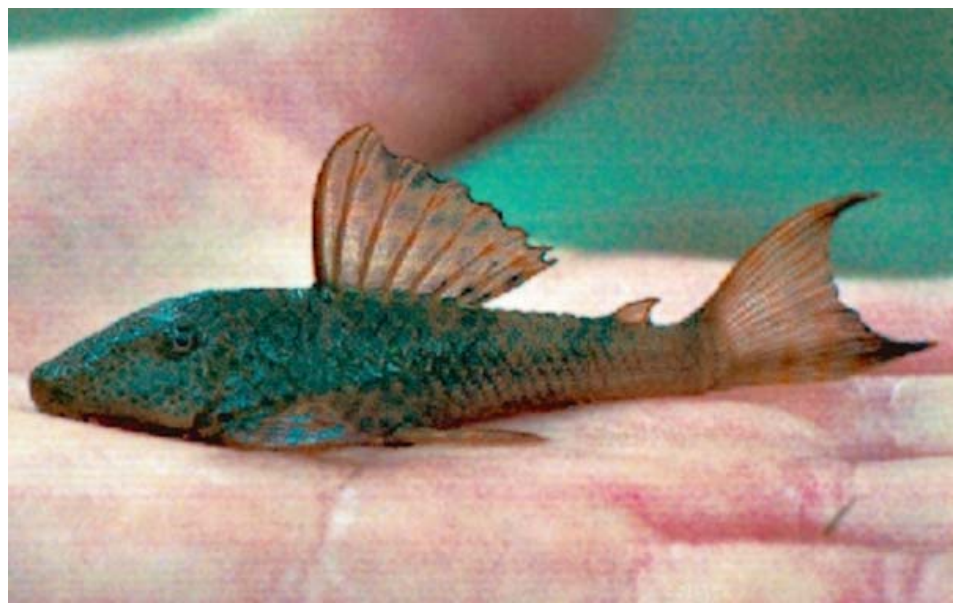
Figure 3. Armadillo del rio from the San Antonio River at the San Antonio Zoo. The small dorsal fin has a single spine and seven rays

Fishes in the genus Hypostomus ( Plecostomus in older references)