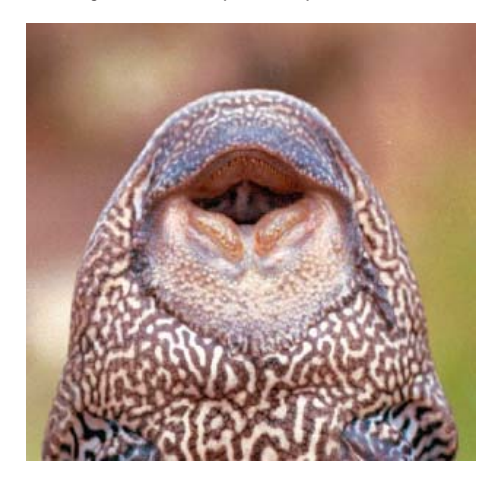
Figure 2. Mouth of a sailfin catfish. The thick, fleshy lips form a sucking disc for attaching to rocks and grazing on algae

benthic, adhering to streambeds and rocks with their mouths. They are vegetarians feeding on detritus and algae. Feeding is done by plowing along the substrate and using the thick-lipped, toothy mouth to scrape plant materials (filamentous algae, diatoms) from hard surfaces or to