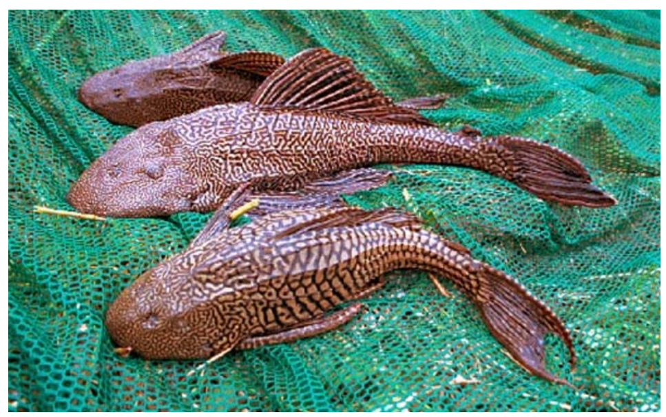
Figure 1. Suckermouth catfishes from the San Antonio River at Lone Star Boulevard, San Antonio, Texas. These are sailfin catfishes and are believed to represent three species: Pterygoplichthys anisitsi (foreground), P. disjunctivus (middle), P. multiradiatus (background)

In appearance and in habits, the suckermouth catfishes or "plecos" of South and Central America (Loricariidae) are markedly different from the bullhead catfishes of North America (Ictaluridae). Bullhead catfishes are terete and naked, with a terminal mouth and a spineless adipose fin. They are free-swimming predators that feed on invertebrates and other fishes. Suckermouth catfishes, in contrast, are flattened ventrally, their dorsal and lateral surfaces covered with rough, bony plates forming flexible armor (Figure 1). Because of this armor, suckermouth catfishes are sometimes referred to as "mailed" catfishes (Norman 1948). The mouth is inferior and the lips surrounding it form a sucking disc (Figure 2). The adipose fin has a spine. The caudal fin is frequently longer ventrally than dorsally. Pectoral fins have thick, toothed spines which are used in male-to-male combat and locomotion (Walker 1968). Suckermouth catfishes are