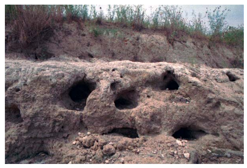
Figure 5. Burrows of sailfin catfishes in the San Antonio River, Texas