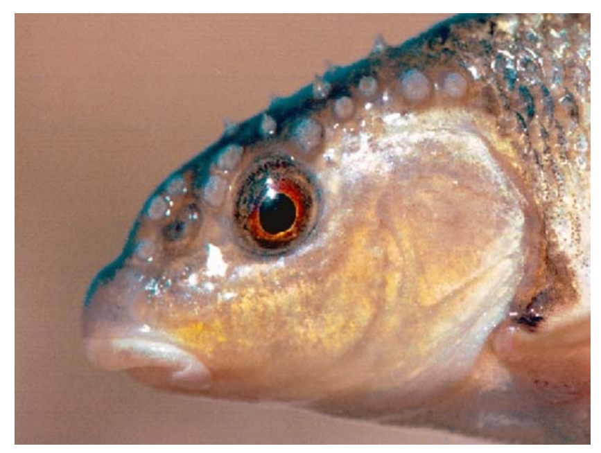
Figure 8. Central stoneroller, Campostoma anomalum, a native herbivore threatened by suckermouth catfishes. The ventrally positioned (inferior) mouth has a cartilaginous ridge on the lower jar used to scrape off attached algae on which the fish feeds. The hooked horns on the dorsal surface of the head are breeding tubercles of the male, which will be lost shortly after spawning

mentally tolerant species that feed on the same foods that they do. Because they are bottom feeders, suckermouth catfishes may incidentally ingest eggs of native fishes. Because they are benthic and