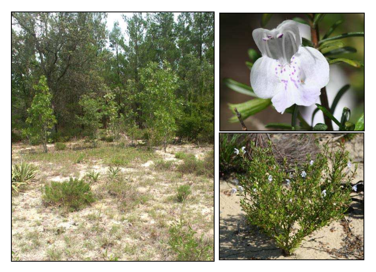
Torreya State Park, Florida.

U.S. Fish and Wildlife Service Southeast Region Panama City Field Office Panama City, Florida