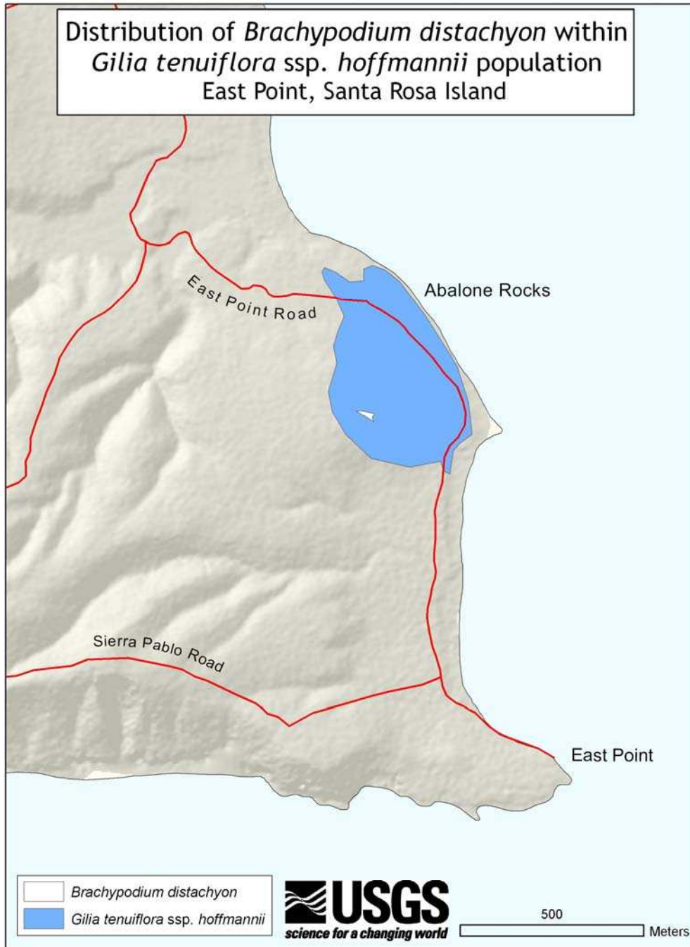
Figure 2: Distribution of False Brome within Hoffmann’s slender-flowered gilia population (Faulkner and Chaney 2007).