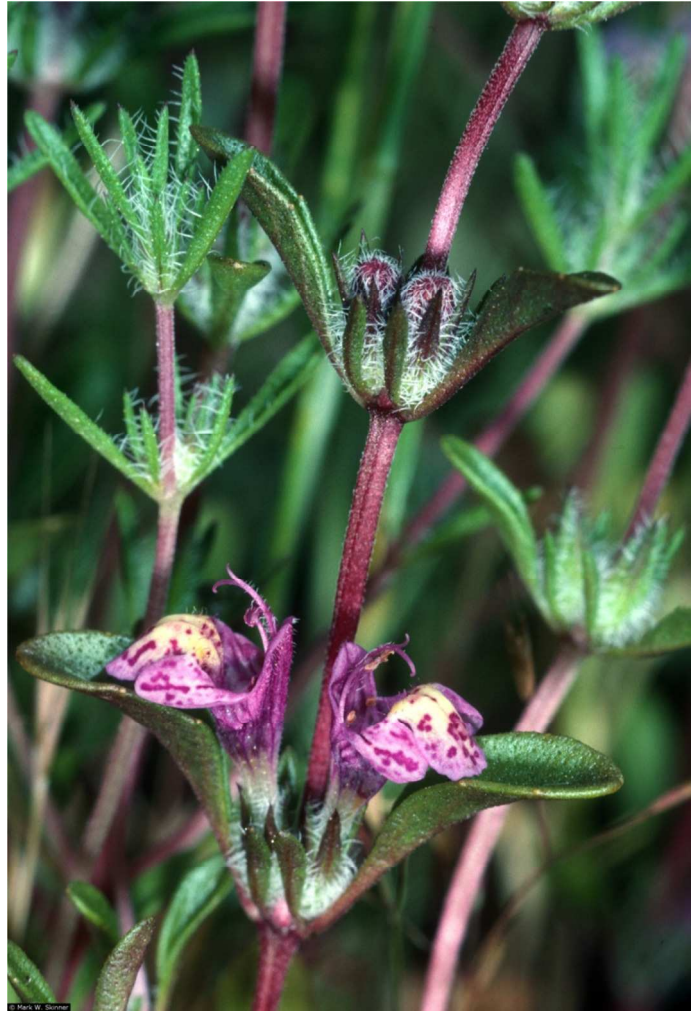
Pogogyne abramsii (San Diego mesa mint).

U.S. Fish and Wildlife Service Carlsbad Carlsbad, CA