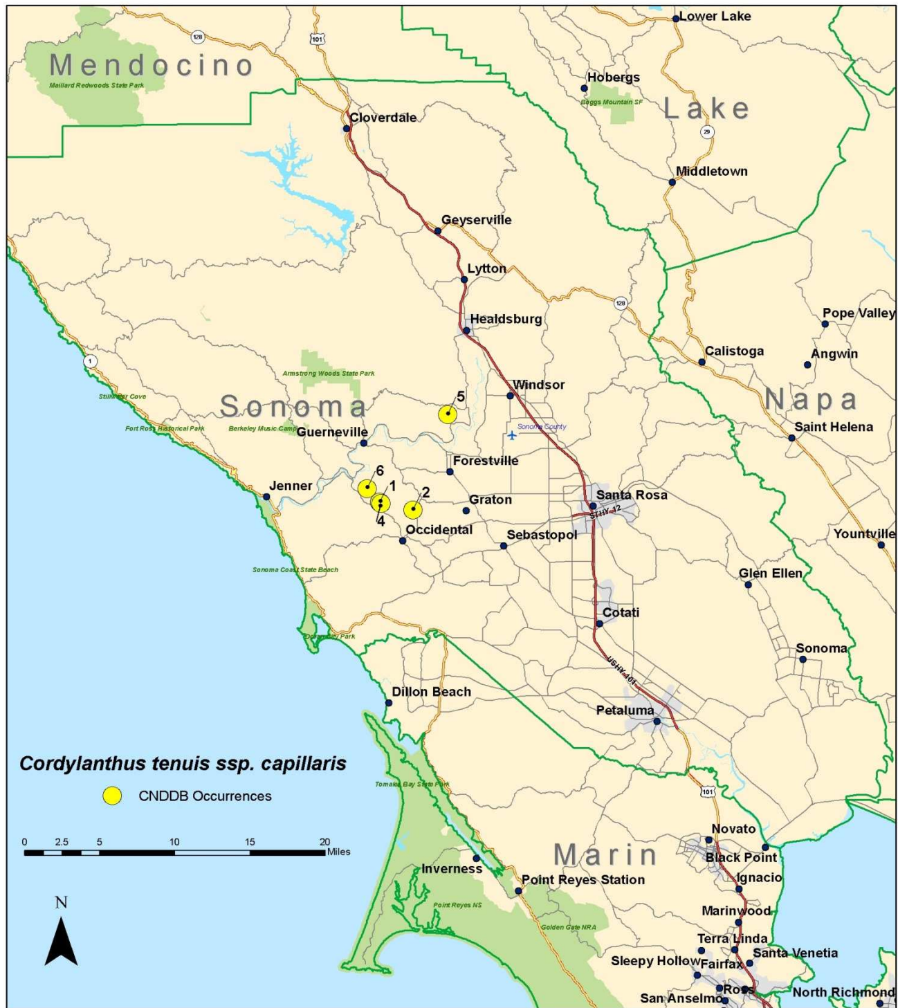
Figure 1. Known CNDDDB occurrences of Cordylanthus tenuis ssp. capillaris , all within Sonoma County, California. Occurrence 6 has been reported, but yet to be entered into CNDDDB (Bittman, in litt. 2011). No Occurrence 3 exists.