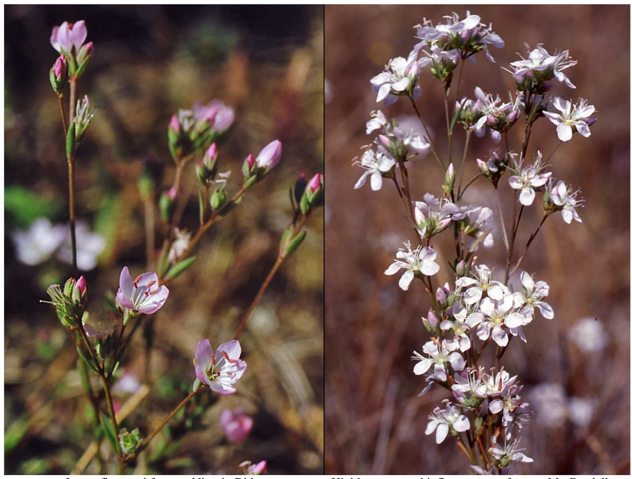
Large-flowered forma - Nicasio Ridge. Highly-congested influorescence forma - Mt. Burdell.

U.S. Fish and Wildlife Service Sacramento Fish and Wildlife Office Sacramento, California