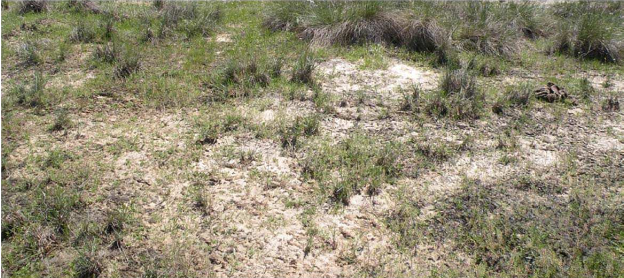
Typical habitat for H. texana in Texas.

associated with Gessner and Katy fine sandy loam soils which sometimes are located at the base of pimple mounds (Smeins 2014).