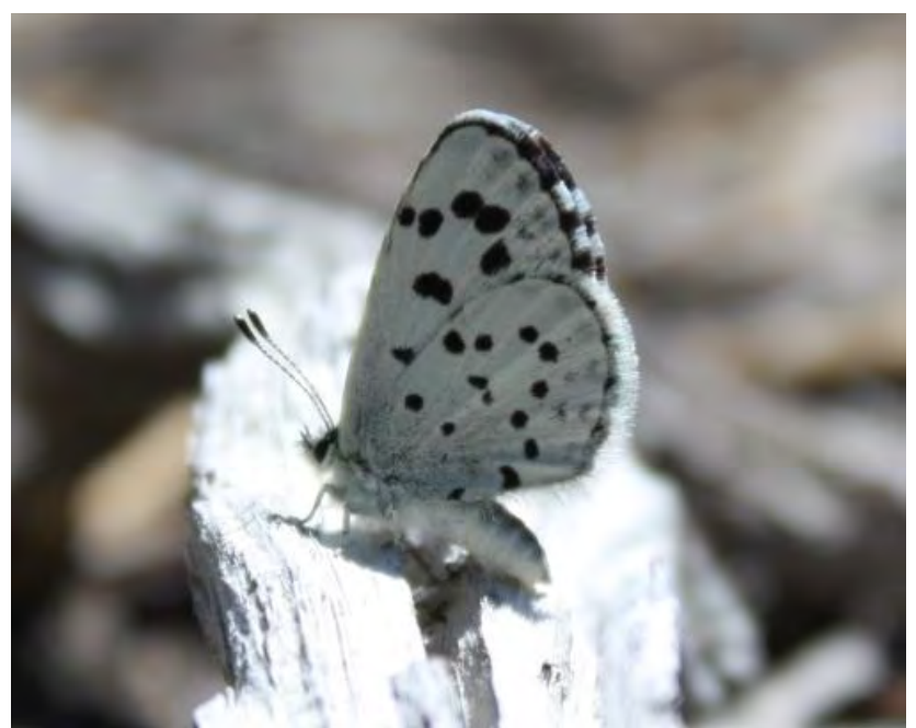
Figure 2: Leona's little blue butterfly roosting on dead twig.