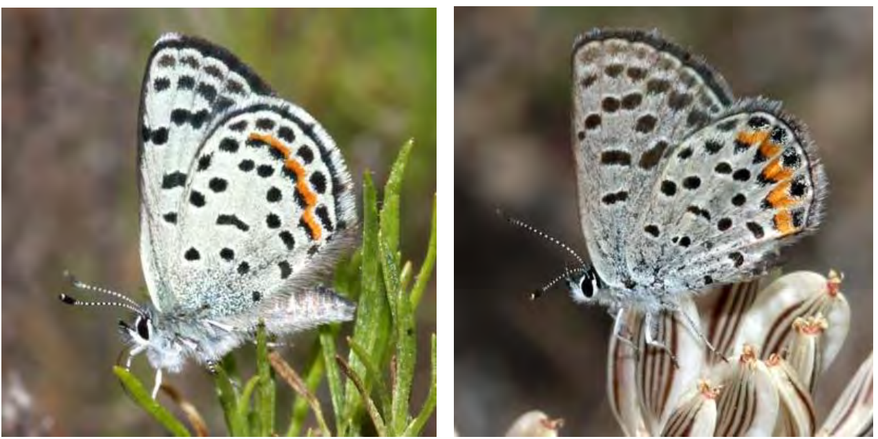
Figure 3: Similar Species: Glaucon blue ( Euphilotes glaucon ) (left) and Lupine blue ( Plebejus lupini ) (right)