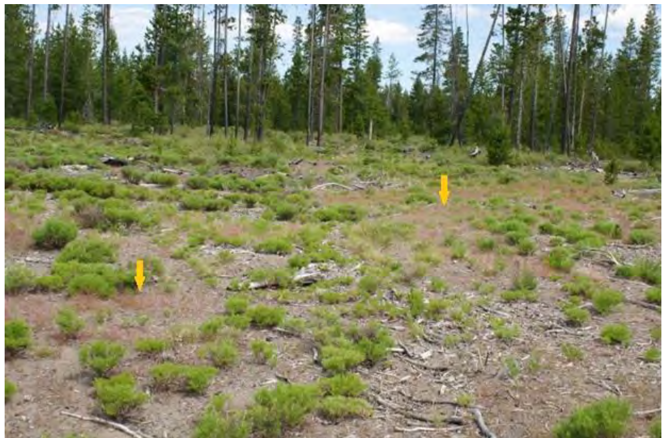
Figure 7: Leona's little blue butterfly habitat in the foreground with lodgepole pine trees in background. The wispy, pink vegetation under the arrows is spurry buckwheat.