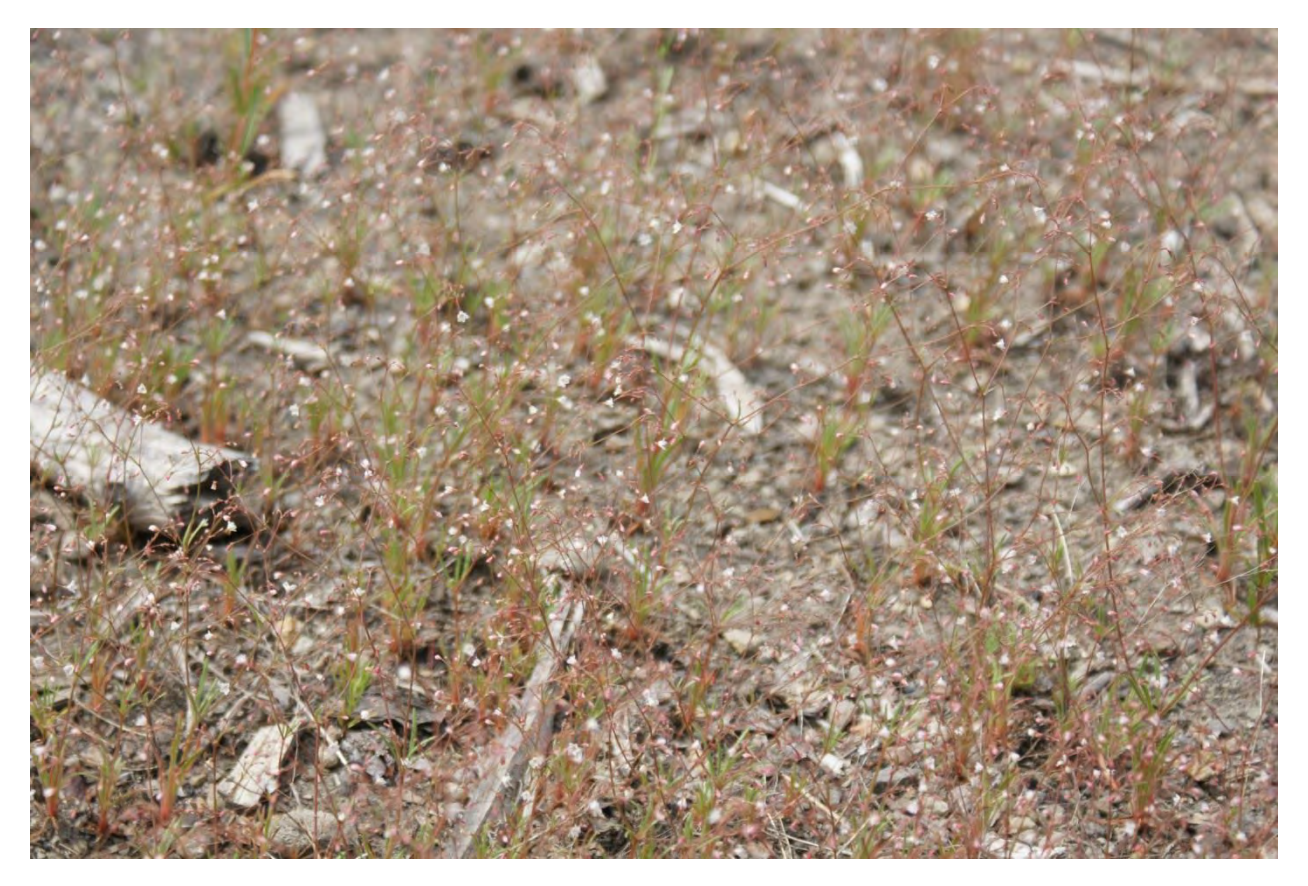
Figure 5: Close-up of spurry buckwheat to show color resemblance to Leona's little blue butterfly larvae. Photo credit: Debbie Johnson.

Figure 4: Leona's little blue butterfly larvae coloration. Also, note the size of the larvae in comparison to spurry buckwheat flowers in the images labeled "second" and "third." Photo credit: James 2012 (p. 96)