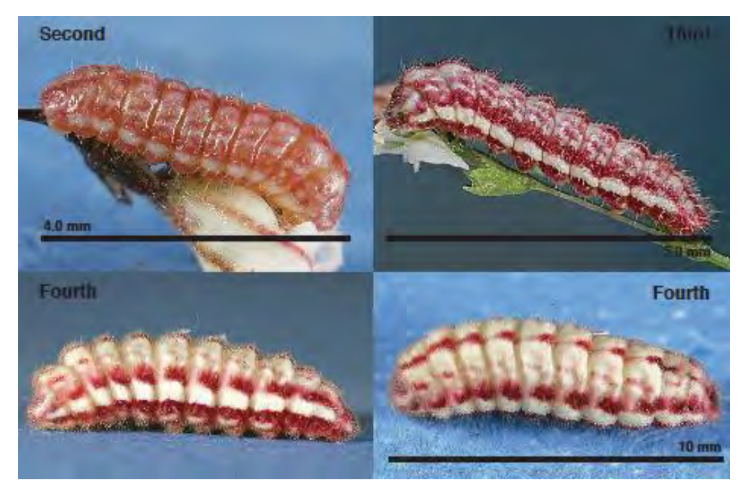
Figure 4: Leona's little blue butterfly larvae coloration. Also, note the size of the larvae in comparison to spurry buckwheat flowers in the images labeled "second" and "third." Photo credit: James 2012 (p. 96)