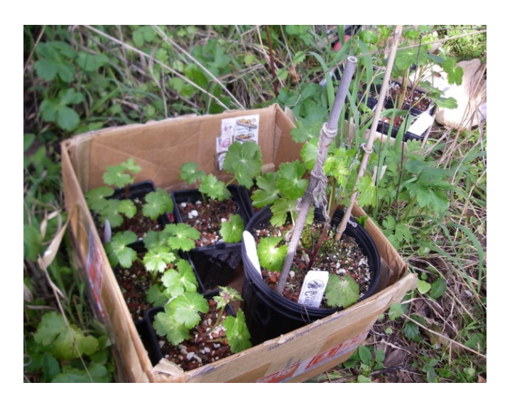
Figure 4 . Transplants Ready for Reintroduction at the Marshall-Petaluma Road Private Ranch.

encouraging accumulation of plant debris. Because large quantities of debris could smother new seedlings, the decision was made to discontinue the practice.