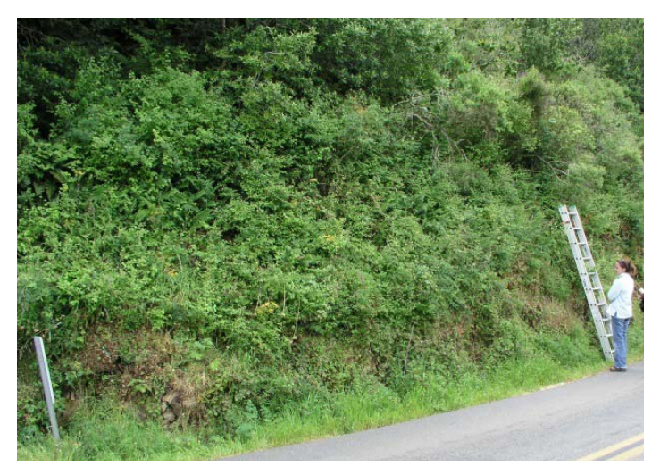
Figure 1. Photo of steep terrain at Marshall-Petaluma Road Historical occurrence of Baker's larkspur.

The site of the Marshall-Petaluma Road Historical occurrence burned in 2004. The fire resulted in changes in the vegetation and microclimate conditions, including destroying the Umbellularia californica (California bay laurel) canopy of the site. The site is now less shady with the loss of the canopy from the fire. Overall, the site has changed from being generally moist and shady to generally drier and sunnier (H. Forbes, UCBG, pers. comm., 2008). Increased sunlight has encouraged the growth of invasive vegetation such as Conium maculatum (poison hemlock) and Genista monspessulana (French broom), which are now more common on the slope. Prior to the fire, poison hemlock was only observed in the roadside ditch. Native Rubus ursinus (California blackberry) appears denser and has the potential to encroach into the Baker's larkspur habitat.