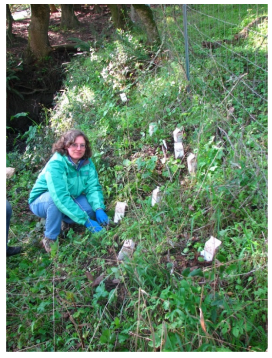
Figure 3. Reintroduction at the Marshall-Petaluma Road Private Ranch.