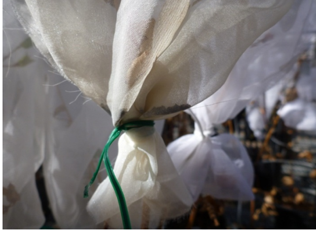
Figure 5. Baker's Larkspur Seed Collection at U.C. Botanical Garden, Berkeley.