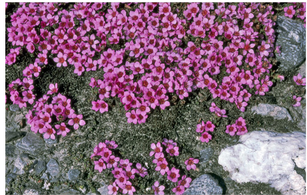
Figure 2. Saxifraga oppositifolia – the world's northernmost plant (83°N) and the highest vascular plant in Europe (4506 m; 46°N) and in North America (4265 m; 39°N). It is considered by Körner (2011) to be growing in the "coldest place for angiosperm plant life on earth". Photo: HJB Birks, Finse, Norway.

The highest mountain in Sweden is Kebnekaise (2096 m; 67°54'N, 18°31'E) and seven other mountains above 2000 m all lie in Swedish Lapland. There is