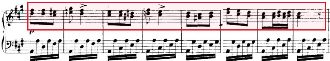
Example 6: S. Mercadante: I due Figaro – Overture, “ Trípili ” theme ( estribillo ): mm. 260-266.

The aforementioned “well-known tune” is drawn on the refrain theme of the “ Tirana del Trípili ”, 162 and originates with what constitutes an important source of national and by then folklorized melody: the tonadilla escénica . During the Fernandine period, the song was frequently associated with the tonadilla entitled Los Maestros de la Raboso . 163 The choice of the Trípili in particular is interesting, as it is the title in which Cortesi had made her mark as ‘tonadillera’ before rapt Barcelona audiences, barely six months before, and therefore suggests that the maestro’s knowledge of this had somehow influenced its inclusion. This key citation is represented only by the last period of the refrain, or second phrase of the estribillo (“anda chiquita, anda salada, que me robaste el alma!”), and thus is used merely for effect. 164