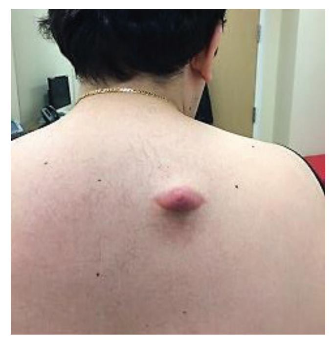
Figure 1. Four subcutaneous, firm, mobile nodules were present on the left forearm and on the right upper, left upper, and left mid back. The largest nodule on the right upper back measured 4-cm x 2-cm with a linear hyperpigmentation that was consistent with a scar from a prior procedure.

The association between multiple pilomatricomas and the autosomal dominant neurodegenerative disorder myotonic dystrophy has been described in the literature. Although the mechanism is unknown, it is hypothesized that the dystrophia myotonica protein kinase mutation in myotonic dystrophy affects intracellular calcium levels, which alter proliferation and terminal differentiation that leads to cells that are observed in pilomatricomas. We present a patient with multiple, symptomatic pilomatricomas and myotonic dystrophy, with a strong family history of both of these rare disorders.