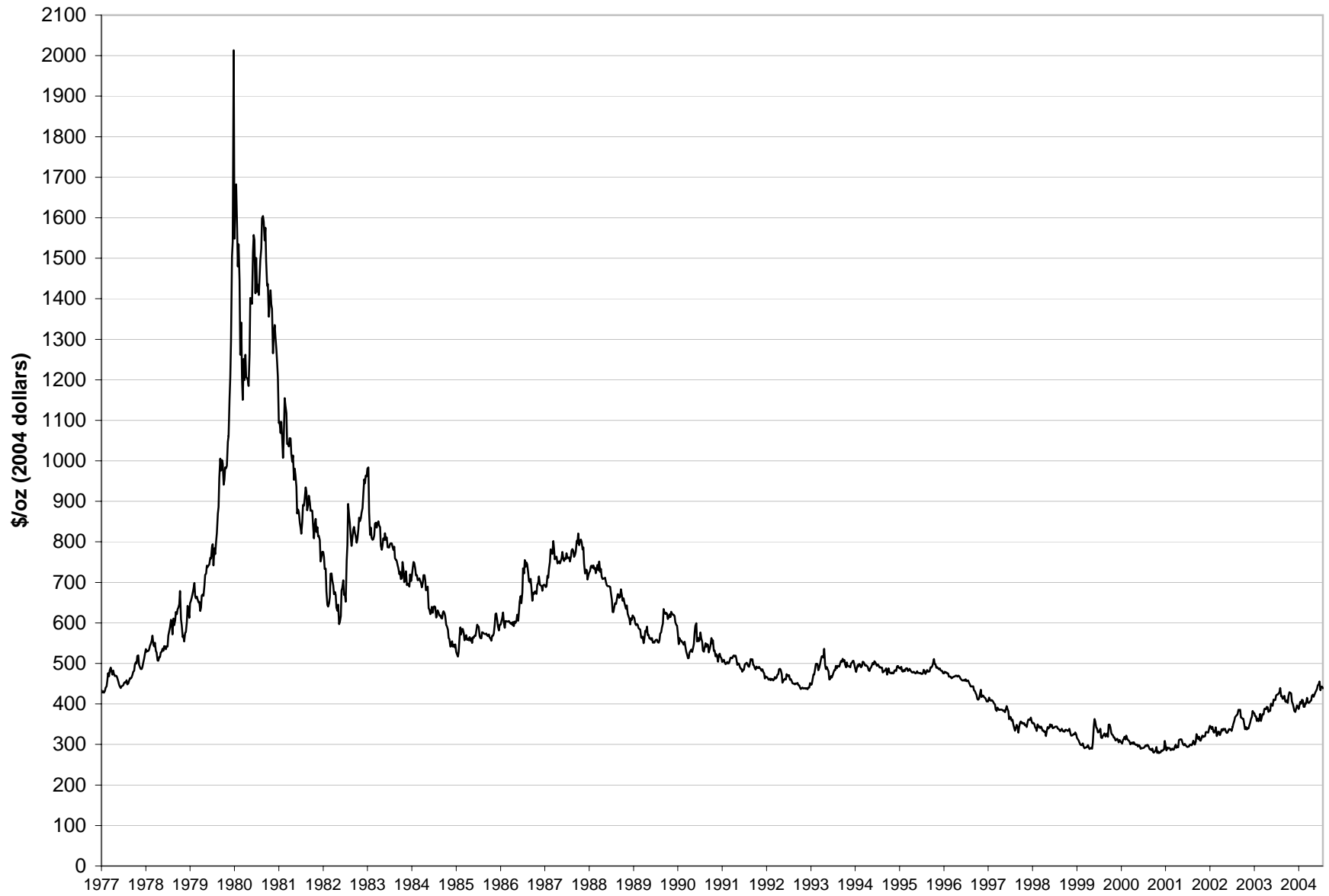
Figure 3: Real Gold Prices, 1977-2004